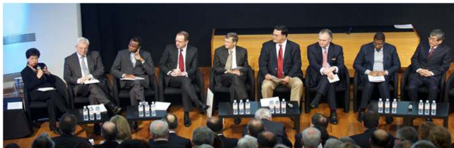
Fig. 2 Announcement of the London Declaration on NTDs in January 2012 by representatives of key partner groups in the global effort to combat NTDs, the World Health Organization, bilateral donor agencies (UKAID and USAID), ministries of health of endemic countries (Mozambique and Tanzania), pharmaceutical companies (GSK, Merck KGaA, and Esai), and philanthropic foundations (Bill and Melinda Gates Foundation). NTDs: Neglected tropical diseases

Expanded disease mapping, systematic data collection and monitoring of progress has allowed to know where the world's neediest are, to track equitable access to preventive treatments, and to hold countries accountable [19, 20]. As an example, a recent collaborative initiative between Uniting to Combat NTDs , the WHO including ESPEN, and the Organization of African Unity (OAU), like the Africa Leaders' Malaria Alliance, has introduced a combined coverage score for the five most prevalent NTDs. This aggregate coverage figure that reflects a country's performance in implementing large scale preventive treatment is reviewed every year by African Heads of State at the OAU General Assembly. In the three years for which the NTD score has been calculated, 2015, 2016 and 2017, great progress has been achieved, with 15 OAU member countries having achieved the WHO recommended coverage of 75% or more for all five NTDs in 2017, as compared to only 3 in 2015. The number of countries having achieved between 25 and 74% coverage