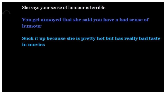
Figure Two: Player Screen of First Date