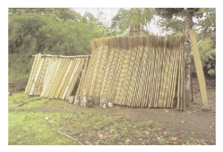
Fig. 4. Laurel timber drying next to a cacao grove.

plants. In some groves, farmers plant coffee as an understory to cacao, so the cacao is actually the shade tree for the coffee.