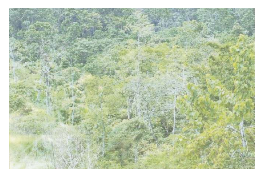
Fig. 2. Heavily shaded cacao can look like a forest, at least superficially.

It is commonly assumed that shade trees are forest remnants (Rice and Greenberg, 2000). An earlier study of cacao in Coastal Ecuador went so far as to say that most shade trees were "native to the area, of an advanced age, without market value, and without utilization value" (Mussack, 1988, p. 54). However, we only visited one farm where the shade trees were survivors from the natural forest. On all other farms, cacao was grown either in full sun or in the shade of trees that the farmers had planted. Some of the planted shade trees were quite large, and looked (superficially) like natural forest, especially when grown on steep, boulder-covered slopes (Fig. 2). But the farmers were quick to point out that they had planted the trees—as much as 40 years previously—lined up in rows, columns and even diagonally, to allow maximum wind passage (or as one farmer called it: by all four winds, por los cuatro vientos). Some of these large shade trees were planted decades after the natural forest had been cut. Some of the farms had first been cleared of natural trees, then planted in banana, sugarcane, or some other field crop for many years before being replanted in anthropogenic forest (see Table I).