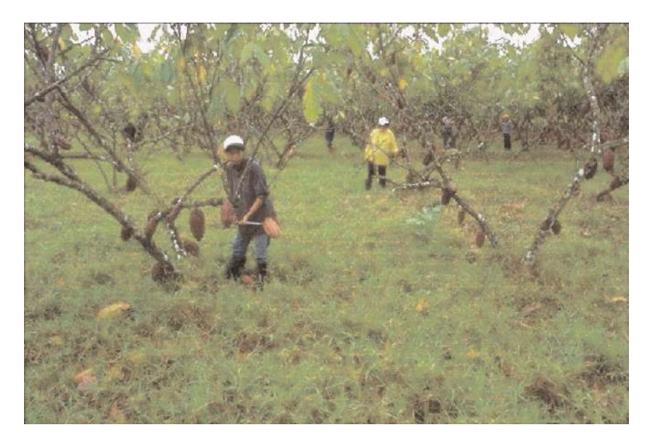
Fig. 3. Harvesting cacao in full sun. Note the dense ground weeds.

Traditional aromatic varieties are common and are generally unirrigated. Farmers use some chemical fertilizer on traditional varieties, but the only farmers who fertilize heavily are those with the modern variety CCN51. Epiphytes (air weeds) have to be cleaned off by hand, but are more common in traditional, shaded cacao. Full-sun cacao, especially CCN51, encourages ground weeds and farmers tend to use more herbicides with it. Farmers use fungicides and insecticides only sporadically (see Table III).