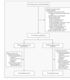
Figure 1. Screening, Randomization, and Rate of Treatment Completion, According to Study Group.