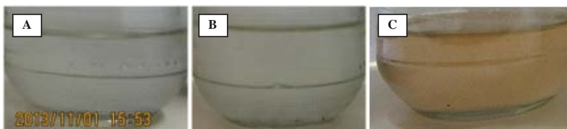
Figure 1. Pitcher liquid of N. rafflesiana : non-induced liquid (NIL) (A), prey-induced liquid (PIL) (B), and chitin-induced liquid (CIL) (C)

spp. NIL, PIL, and CIL inhibited the growth of C. albicans and C. glabrata . The diameters of the inhibition zones found on testing of NIL, PIL, and CIL against C. albicans were 35.00 (35.00 – 39.33) mm, 26.33 (23.00 – 40.00) mm, and 30.00 (28.00 – 32.00) mm, respectively. For tests against C. glabrata , the inhibition zone diameters of NIL, PIL, and CIL were 22.22 \pm 3.66 mm, 29.89 \pm 2.79 mm, and 28.89 \pm 1.17 mm, respectively. No inhibition zones were found in NIL, PIL, and CIL tests against C. krusei and C. tropicalis . (Table 1 and Figure 2).