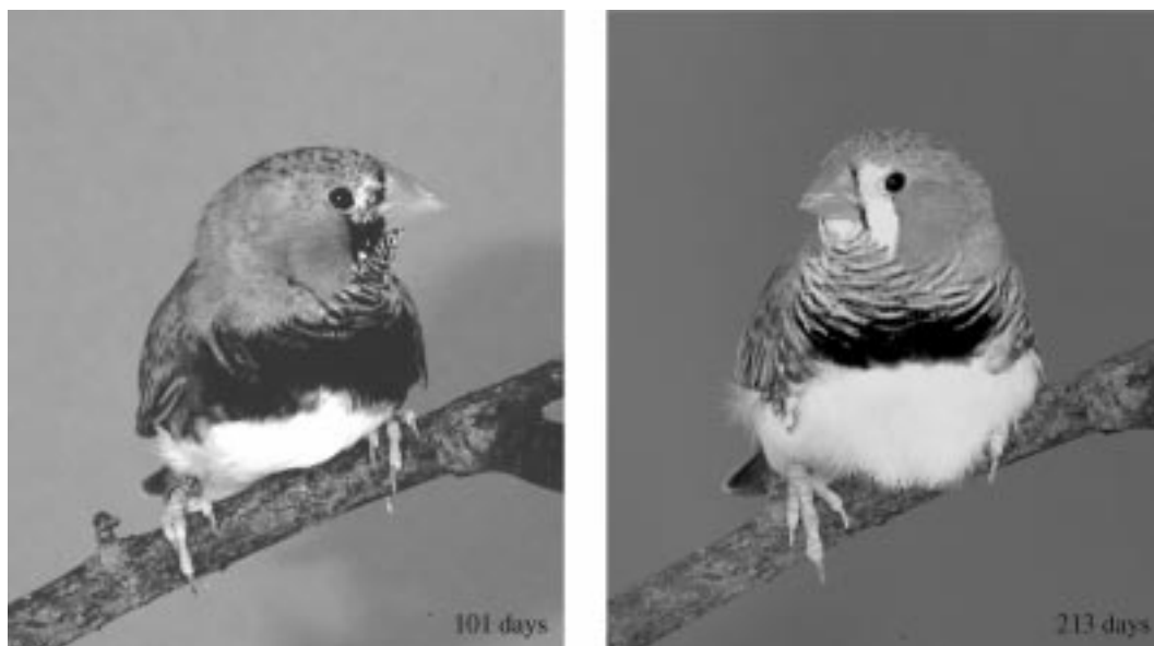
Figure 2. An example of a male zebra finch reared on a seed-only diet at 101 days of age showing abnormal areas of melanistic plumage (left) and the same individual after its second complete body moult aged 213 days (right).