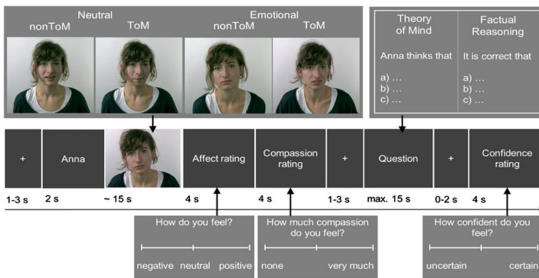
Fig. 1. EmpaToM trial sequence. Following a 2 (Emotionality of the Video) \times 2 (ToM Requirements) design, four different video types were presented for each actor: Emotionally negative and neutral videos; videos with and without ToM demands, thereby leading to ToM vs factual reasoning questions. After each video, participants rated their own affect and their compassion for the person in the video. Subsequently, they answered a ToM or non-ToM (i.e. factual reasoning) question about the video. After each question, participants rated their confidence regarding their performance in the question. These ratings were used to calculate metacognition performance.

Material (Supplement S1). The videos differed in emotionality (emotionally neutral vs negative contents) and in what question they gave rise to (ToM vs nonToM). In total, 48 trials were presented (12 per condition). After each video, participants were asked to rate how they felt (on a scale from negative to positive; 4 s) and how much compassion they felt for the person in the previous video (scale from none to very much; 4 s). After a fixation cross (1–3 s), a multiple choice question with three response options was presented. The questions demanded either ToM reasoning or factual reasoning on the contents of the previous video. Participants had a maximum of 14 s to select one of the response options, which was then highlighted and remained on the screen for another second. After a fixation cross (0–2 s), a confidence rating was presented asking participants how confident they were to have chosen the correct response in the previous question (4 s). The confidence rating consisted of a continuous rating scale and the rated position was coded in values from 1 (uncertain) to 720 (certain). The rating scale numbers were not visible to the participant on the rating scale, but six sections indicated by seven reference lines (1–2: 1–120; 2–3: 121–240; 3–4: 241–360; 4–5: 361–480; 5–6: 481–600; 6–7: 601–720) were given to guide people’s responses. In the present manuscript, we focus on the confidence ratings.