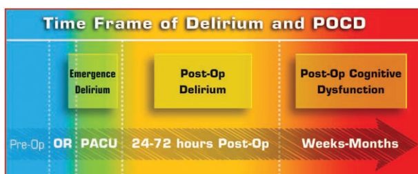
Fig. 1. One of the principal distinctions between postoperative (Post-Op) delirium and postoperative cognitive dysfunction (POCD) is the time frame in which they are found. Emergence delirium occurs in the operating room (OR) or immediately after in the post-anesthesia care unit (PACU). Postoperative delirium occurs 24 to 72h after surgery. POCD is measured at weeks to months after surgery and anesthesia. Pre-Op, preoperative. Reproduced with permission from Silverstein et al. 99

Further support for the role of neuroinflammation in postoperative cognitive dysfunction comes from studies that have demonstrated that genetic polymorphisms that modulate inflammation ( e.g. , in the genes CRP , SELP , GPIIIA , and iNOS ) are associated with postoperative cognitive dysfunction risk. 124–126 Additionally, inflammatory processes during cardiac surgery may be augmented by four factors during cardiopulmonary bypass (CPB). First, blood contact with foreign surfaces of the CPB circuit causes significant peripheral inflammation, including multiple-fold elevations of the proinflammatory cytokines interleukins 6 and 8 (IL-6, IL-8). 127 This effect can be reduced by using CPB pumps with biocompatible materials and miniaturized circuits, which reduce leukocyte aggregation, complement and coagulation cascade activation, and proinflammatory