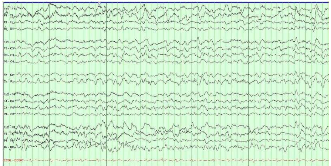
FIGURE 3: EEG shows diffuse slowing and focal slowing sharply contoured waves in the left temporal region. These findings are consistent with an encephalopathy, focal left temporal lobe dysfunction, and possible epileptogenicity.

The patient was started on antiepileptic medication prophylactically given the possibility of subclinical seizures in this patient with an area of encephalomalacia and epileptiform discharges in the right temporal region. The patient was treated empirically with vancomycin, meropenem, and acyclovir. A lumbar puncture did not reveal any evidence of central nervous system infection (see Table 1). Due to his progression in symptomatology, he was then tested for COVID-19 and found to be positive. The patient developed respiratory failure and required intubation and was transferred to the ICU. Based on anecdotal experience from other medical centers, the patient was started on hydroxychloroquine and lopinavir/ritonavir, and was continued on broad-spectrum antibiotics. The patient currently remains in the ICU, critically ill with poor prognosis.