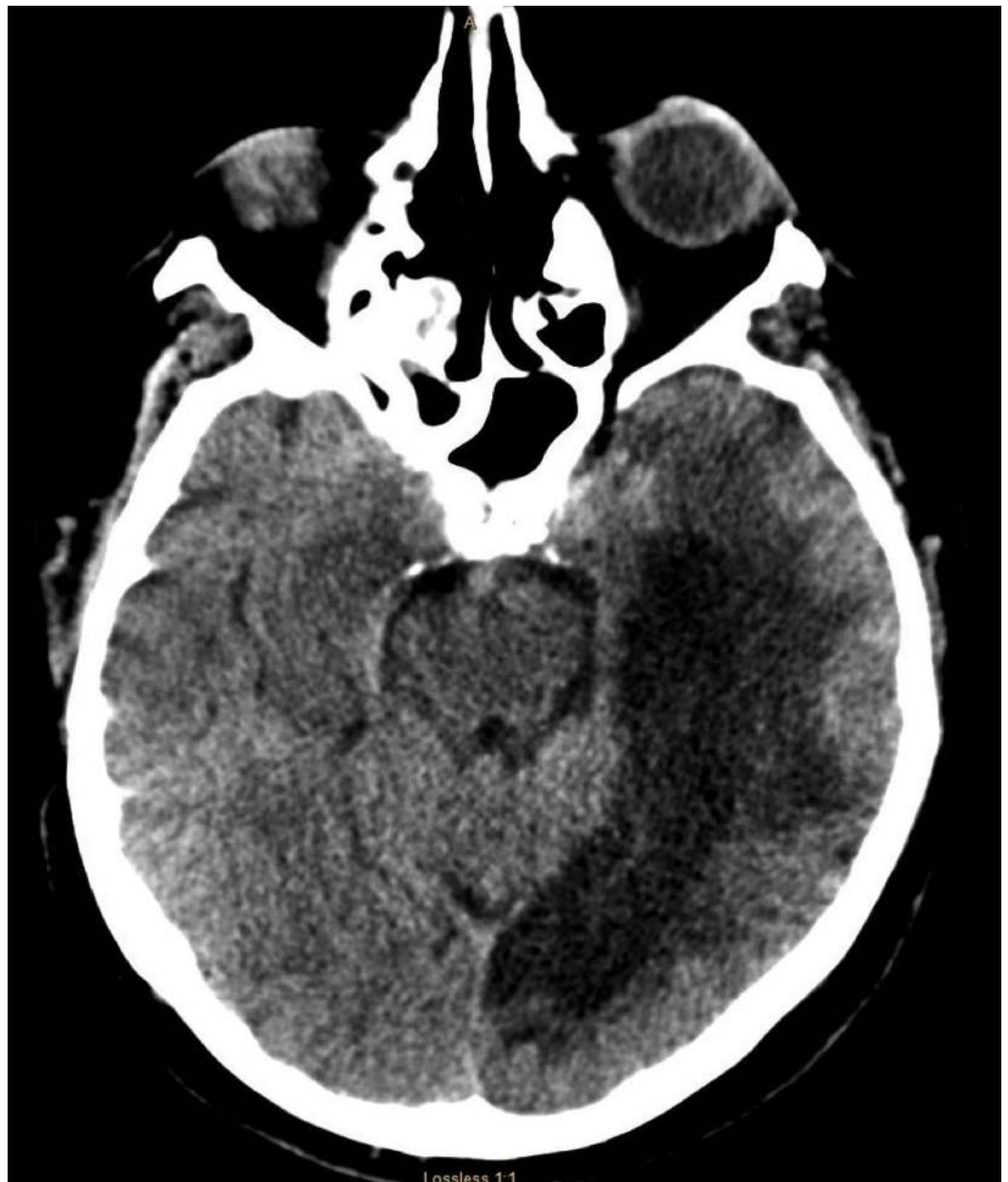
FIGURE 2: CT scan of the head that shows no acute changes. There is an area of hypodensity in the right temporal region, consistent with patient know prior history of left PCA embolic stroke