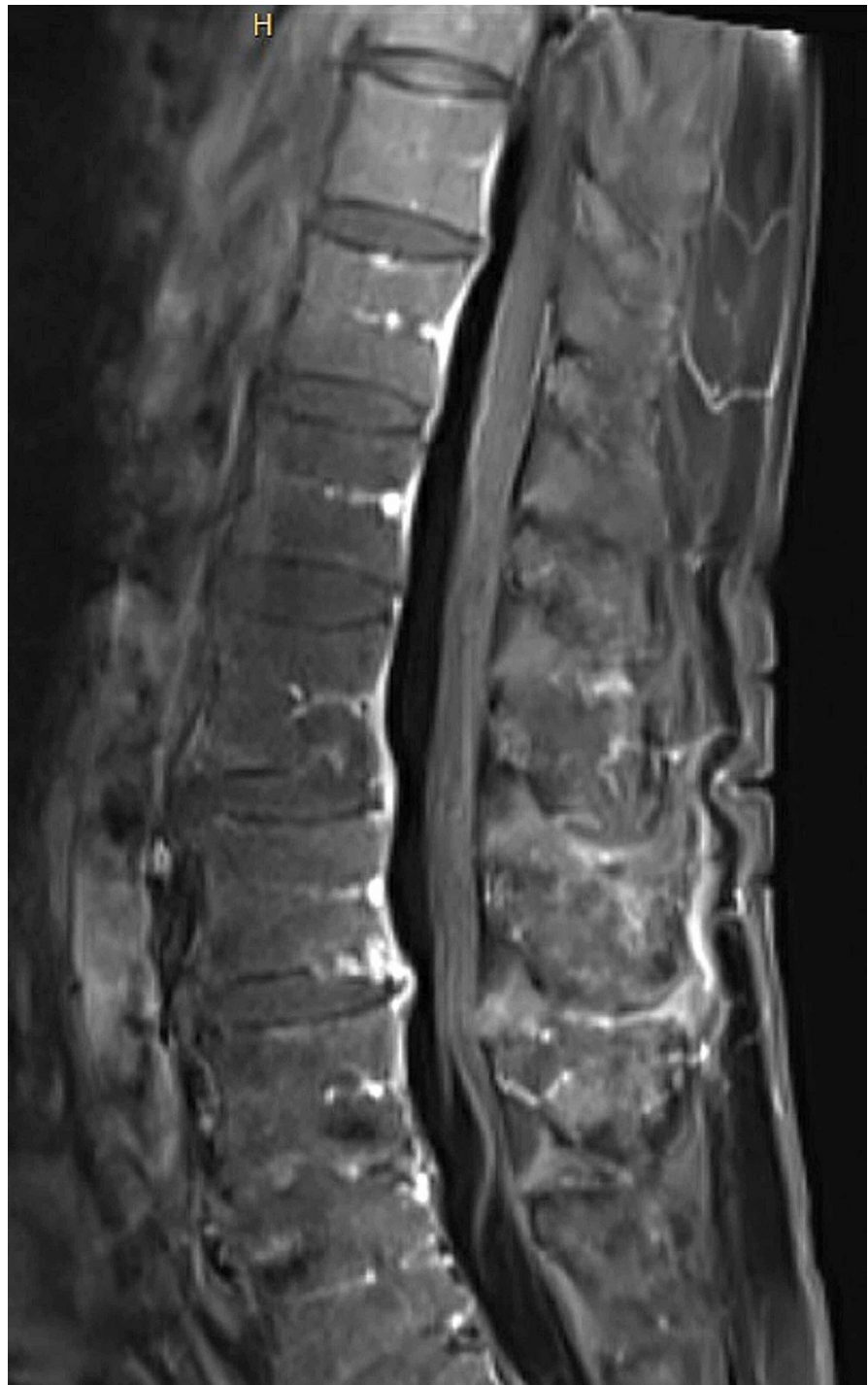
FIGURE 3: MRI lumbar spine with contrast

Sagittal T1 post-contrast MRI lumbar spine demonstrating enhancement of cauda equina nerve roots indicative of Guillain-Barre Syndrome