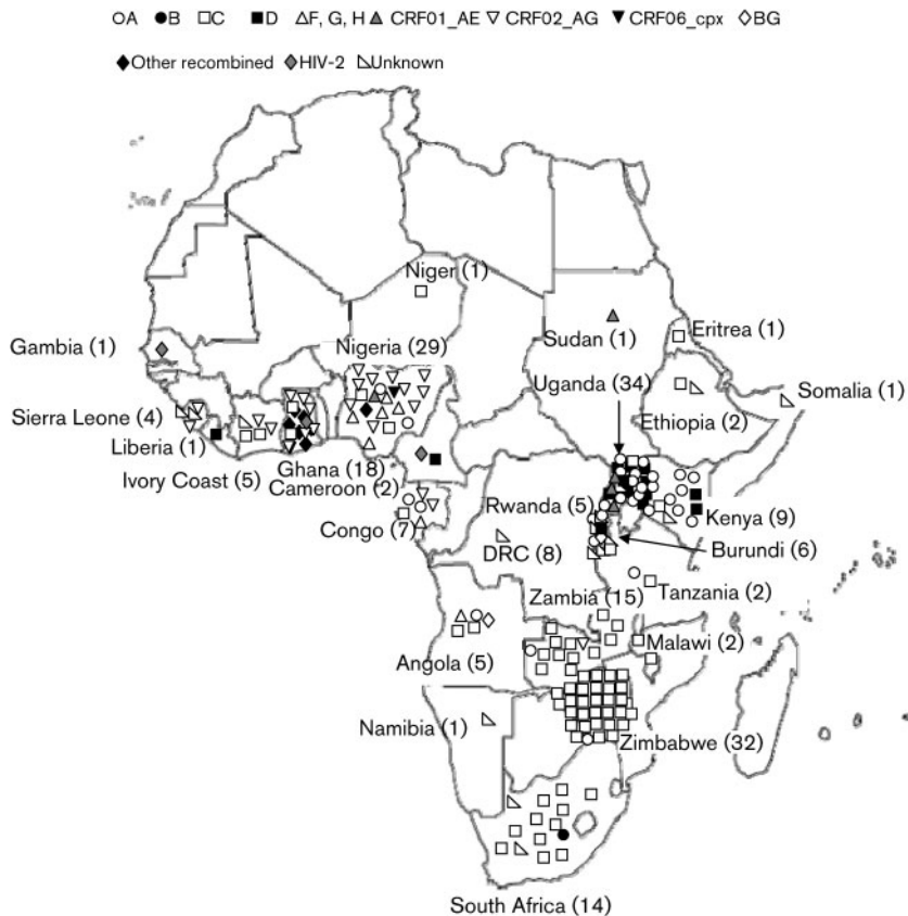
Fig. 1. The clade diversity of the African East London HIV-1 cohort. Numbers in parentheses are the numbers of patients sampled who were born in that country. Each symbol represents one patient.

cpx and some recombinants) are not discussed in detail. Only 160 infections (clades A, B, C, D, G, CRF01_AE and CRF02_AG were significantly represented; Table 2) were included for analysis.