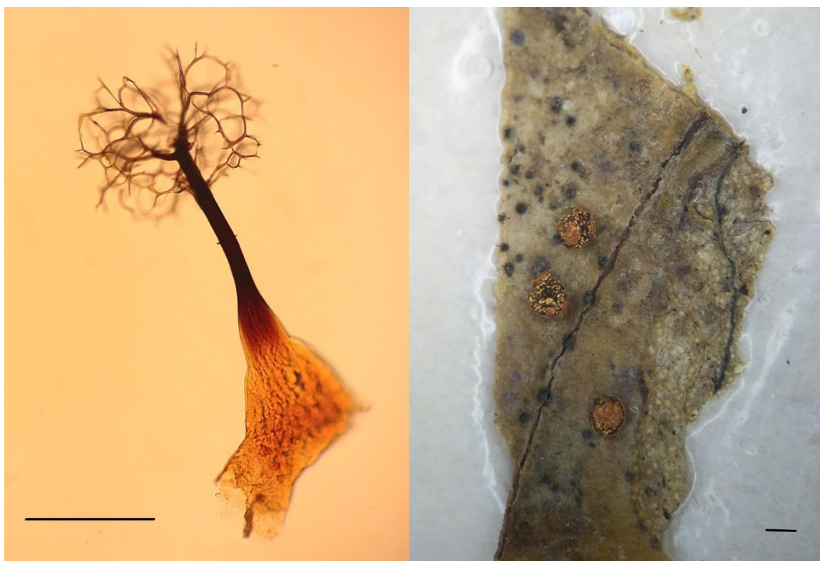
Fig. 2 – Images of two species not previously recorded in Costa Rica. Left. Paradiacheopsis solitaria (USJ 104006) from Las Tablas, scale is 100 µm. Right. Physarum lateritium (BioRep 6722) from Bonilla, scale is 1 mm. For details see the Materials and Methods section.

From Las Tablas Protected Zone, 8.923780 N and 82.722837 W at 1550 m. Recorded in a moist chamber culture prepared with leaf litter from the lower section of a ground litter layer 6 cm deep. In a tropical lower montane wet forest dominated by Quercus spp. on the Pacific slope. Material collected on 10 January 2014. pH = 4.31. Collection Ro-4920 (USJ 104006). New record for Central America.