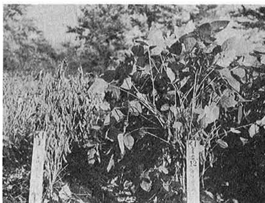
Fig. 2 New soybean variety "Raiden" by mutation breeding (left) and its original variety "Nemashirazu" (right)

bred in 7 or 8 years after initiation of the breeding works.