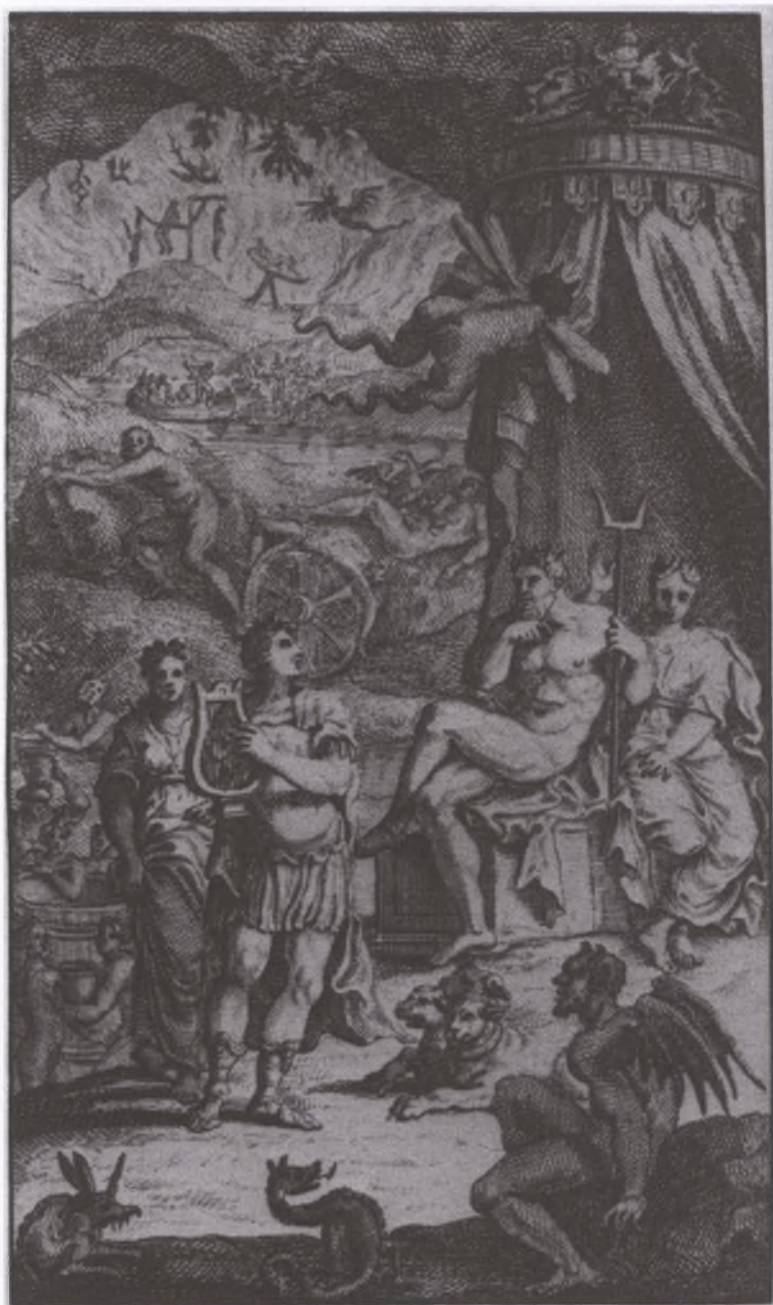
Figure 16.1 Engraving by E. Kirkall, the frontispiece to Weaver, The Fable of Orpheus and Eurydice (London, 1718).