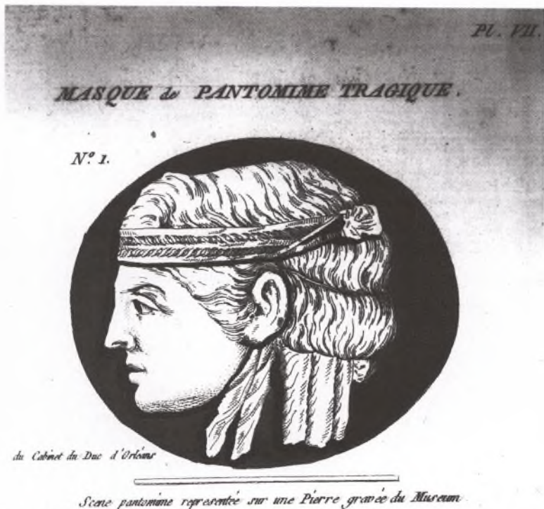
Figure 0.4 Engraving in François Henri Stanislas de l'Aulnay, De la Saltation théâtrale, ou recherches sur l'Origine, le Progrès, & les effets de la pantomime chez les anciens (Paris, 1790).

Pantomime masks, which were distinguished from tragic masks by their closed mouths and greater visual beauty, were depicted on monuments of the imperial era, 64 and have inspired artists and engravers since the eighteenth-century revival of interest in ancient pantomime (see Fig. 0.4). But the clothing and props used by the dancer have been less thoroughly investigated, even though the social language of costume was a fine science in imperial Rome. 65 Perhaps