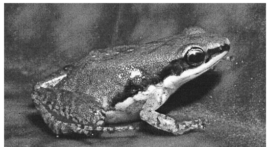
Fig. 3. Female paratype (ZSM 600/2001) of Mantidactylus madinika .

Paratypes .—MRSN A2066 and ZSM 600/2001 (Fig. 3), two adult females, same locality and collecting data as holotype; ZFMK 76103 and ZSM 603/2001–607/2001, five adult males and