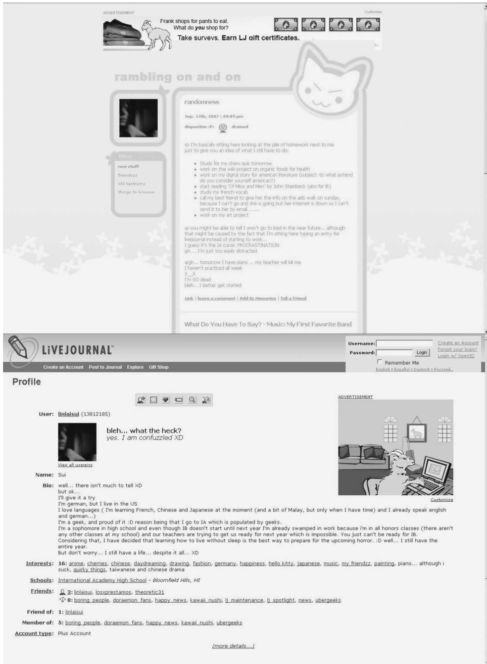
Typical 'Livejournal' Blog Front Page and Profile (accessed 5 September 2007)