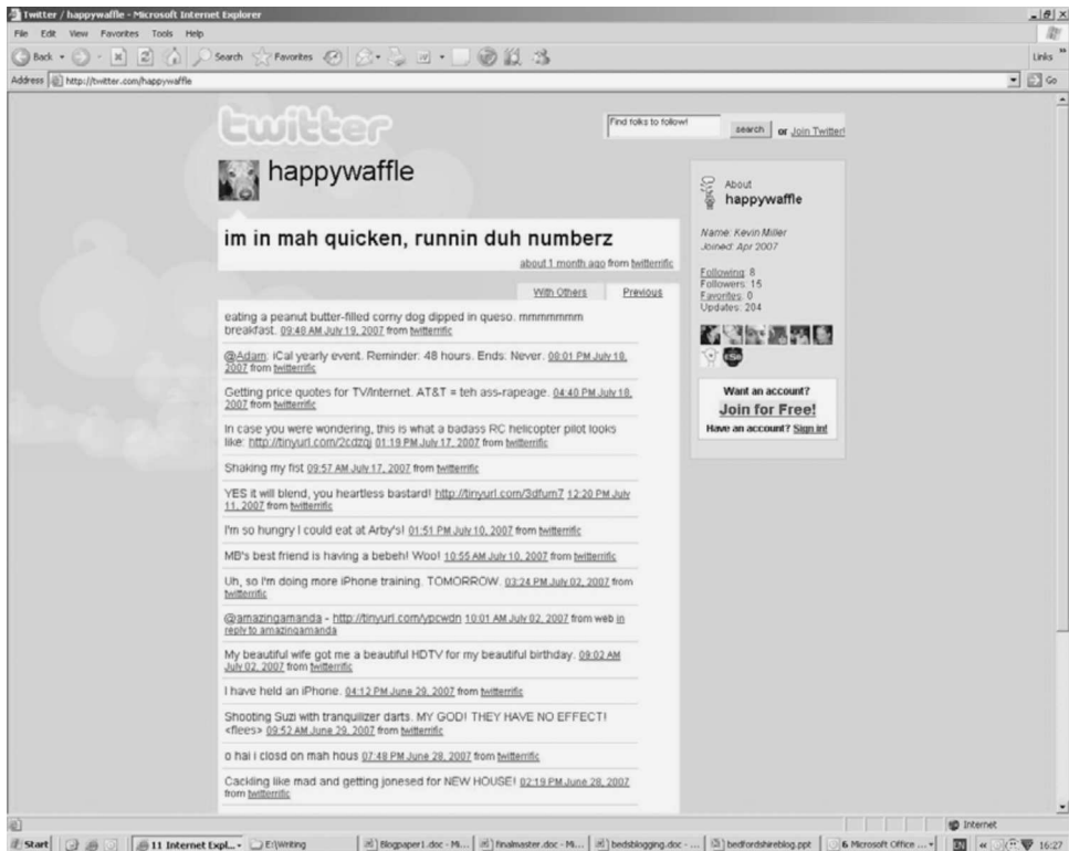
FIGURE 3 Typical Twitter Profile (accessed 5 September 2007)

The point of twitter is the maintenance of connected presence, and to sustain this presence, it is necessarily almost completely devoid of substantive content. Thus twitter is currently the best example of 'connected presence' and the phatic culture that results