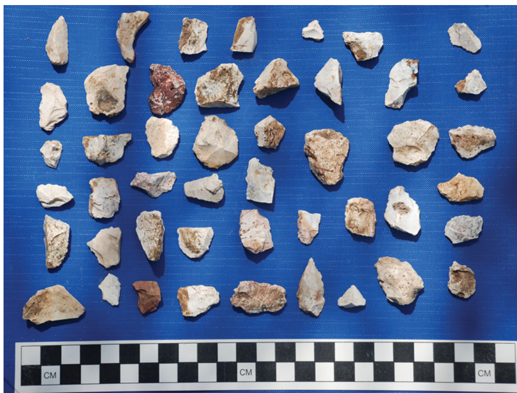
Figure 4. The flake-based lithic assemblage produced with white patinated flint from POI.15.31.