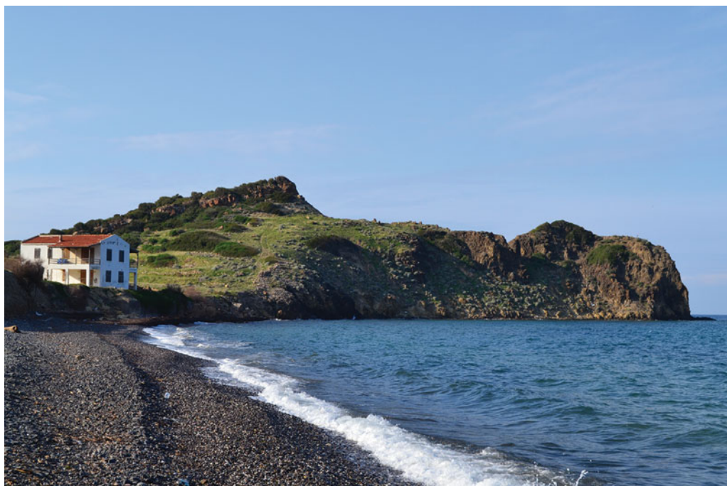
Figure 2. General view of the volcanic outcrops at Kömürburnu locality where Lower Palaeolithic activity has been identified (POI.15.28).

In the 1960s, non-systematic research in Izmir Province recovered two Palaeolithic handaxes. One of them has been attributed to the Lower Palaeolithic; it is a very large, flat and elongated flint biface with irregular edge profiles (Kansu 1963). The other biface is ovate in shape and relatively small; this has been attributed to the Micoquian and probably of Middle Palaeolithic date (Kansu 1969). Taking into account their technological properties, these two isolated finds from the neighbouring areas are different to the Karaburun biface. They do, however, reflect the presence of bifacial industries in this westernmost part of Anatolia, which may also be considered alongside the Acheulean site of Rodafnidia on Lesbos, especially when we consider the existence of a land bridge between these two localities during the Lower Palaeolithic (Galanidou et al. 2013).