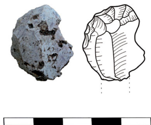
Figure 5. A typical endscraper with semi-abrupt retouch from POI.15.31 (drawing by G. Özçolak and E. Sezgin).

(around 10 per cent of the assemblage) can be attributed to a specific tool type: three endscrapers, three notches and six retouched flakes. The endscrapers were made on flakes and are highly reduced (Figure 5). Unretouched flakes dominate the assemblage (63 pieces), with an average length of 27mm (ranging from 14–70mm; standard deviation: 9.14mm). Only three blades are represented, of which two are crested. There are five cores in the assemblage, including one blade core.