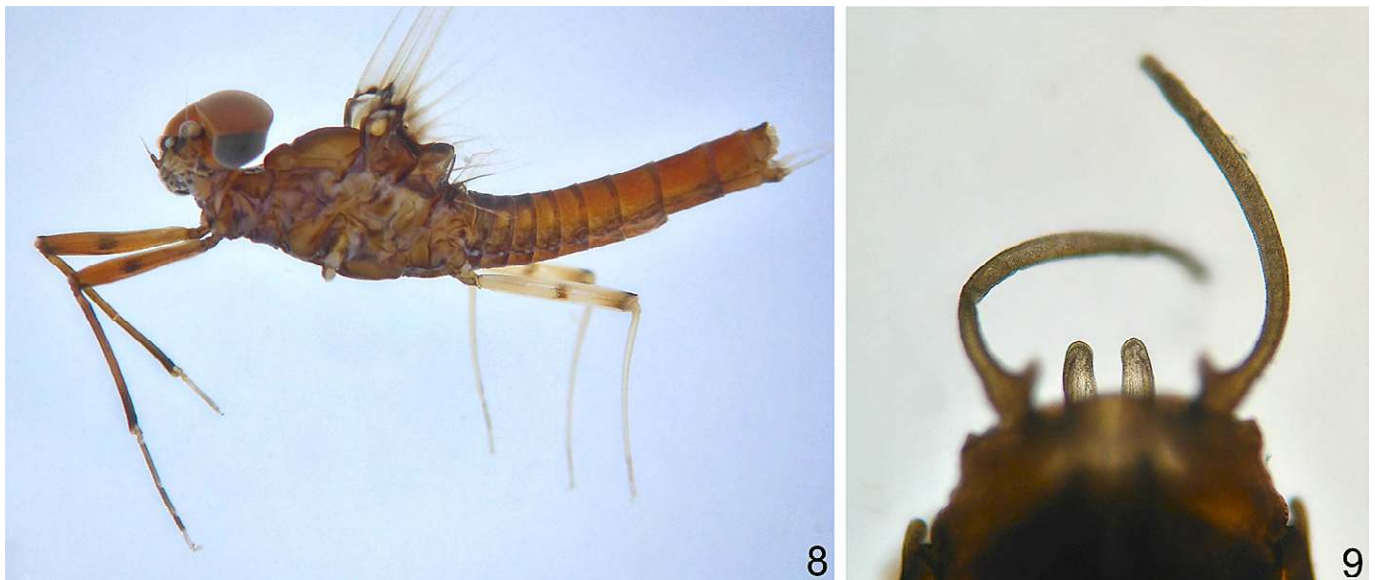
Figures 8, 9. Ulmeritoides flavopedes . 8. Male imago, lateral view. 9. Genitalia (ventral view).

Diagnosis. Male imago: 1) Membrane of fore wing hyaline, wing bases brown; 2) apex of penis lobes rounded, each with a lateral groove; 3) abdominal terga orange-brown, posterior margins blackish.