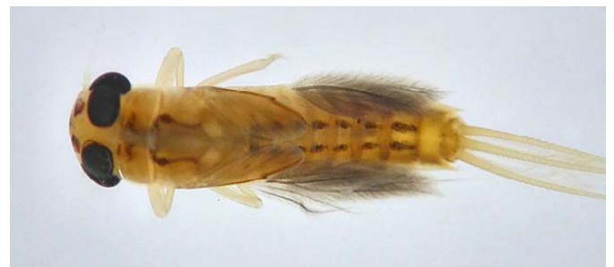
Figure 7. Nymph of Tikuna bilineata (dorsal view).

Examined material. One male (UFRR 134) and one female adults (UFRR 135), Brazil, Tocantins state, Palmas, district of Taquaruçu, Evilson waterfall, 21–25.III.2016, T.K. Krolow col.