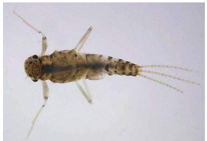
Figure 4. Nymph of Amanahyphes bahiensis (dorsal view).

Diagnosis. Male imago: 1) femoral spines long, slender and acuminate; tarsal claws with 10–11 marginal denticles and 2+3 subapical submarginal denticles; 2) gill formula (number of lamellae per gill) 3/2/2/2.