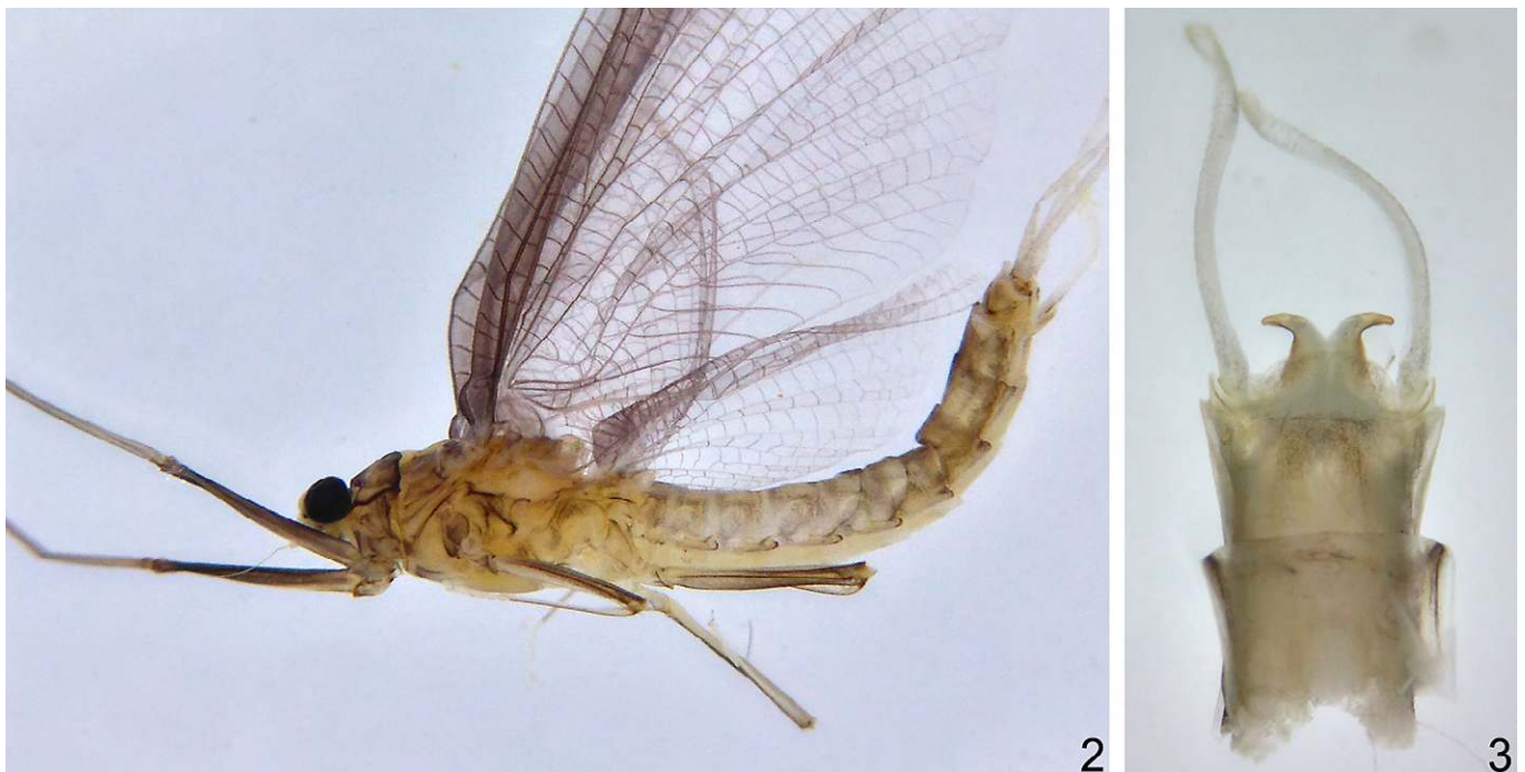
Figures 2, 3. Campylocia demoulini . 2. Male imago, lateral view. 3. Genitalia (ventral view).

Examined material. One male imago (UFRR 131), Brazil, Tocantins state, Palmas, district of Taquaruçu, Evilson waterfall, 21–25.III.2016, T.K. Krolow col.