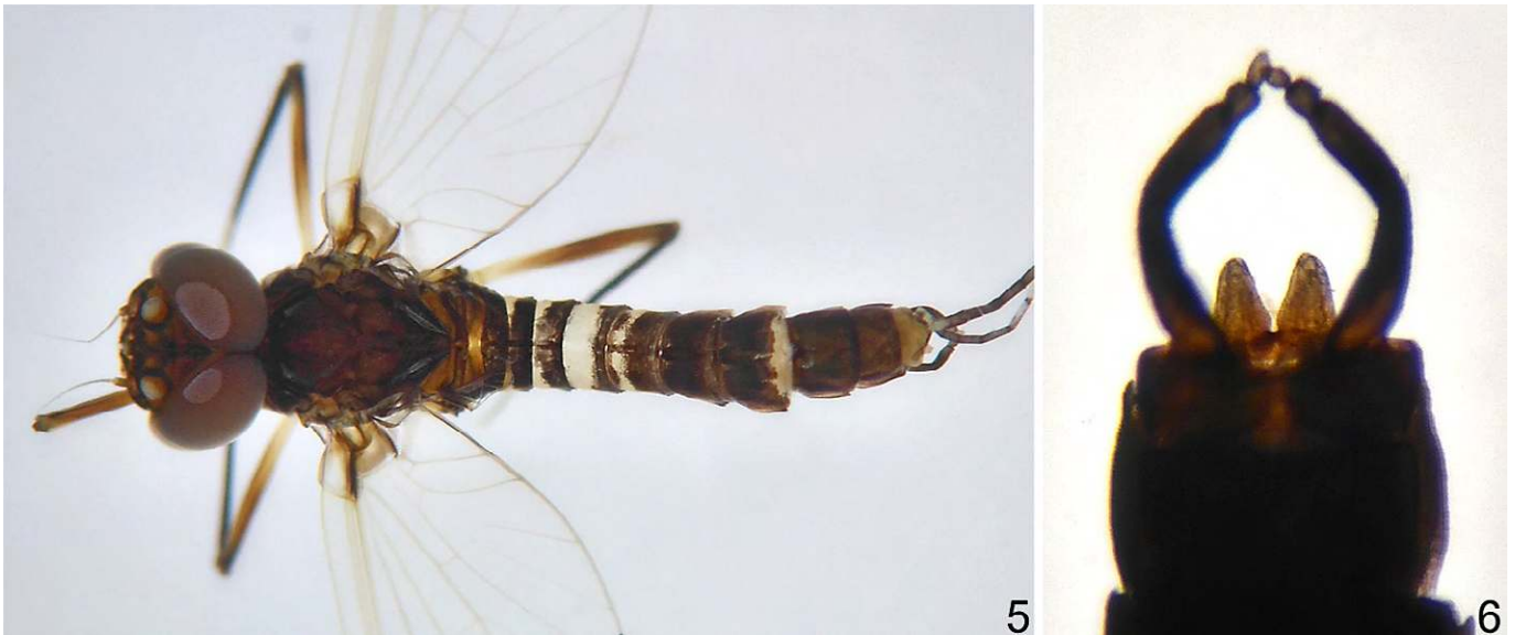
Figures 5, 6. Simothraulopsis demerara . 5. Male imago (dorsal view). 6. Male genitalia (ventral view).

Previous distribution. Brazil: state of Bahia (MOLINERI et al. 2015).