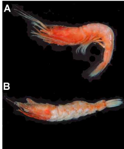
Fig. 3. Two penaeoid shrimps from Korea. A, Hadropenaeus lucasii (Bate, 1881), male (CL 8.4 mm) from the northeastern water of Jeju Island; B, Sicyonia truncata (Kubo, 1949), female (CL 8.2 mm) from the same locality.

Remarks: In Korea, the superfamily Penaeoidea contains two families, Penaeidae and Solenoceridae. Sicyonia truncata is the first member of the family Sicyoniidae recorded from Korea. The family is easily distinguishable from the Penaeidae and Solenoceridae by its rigid and stony integument and