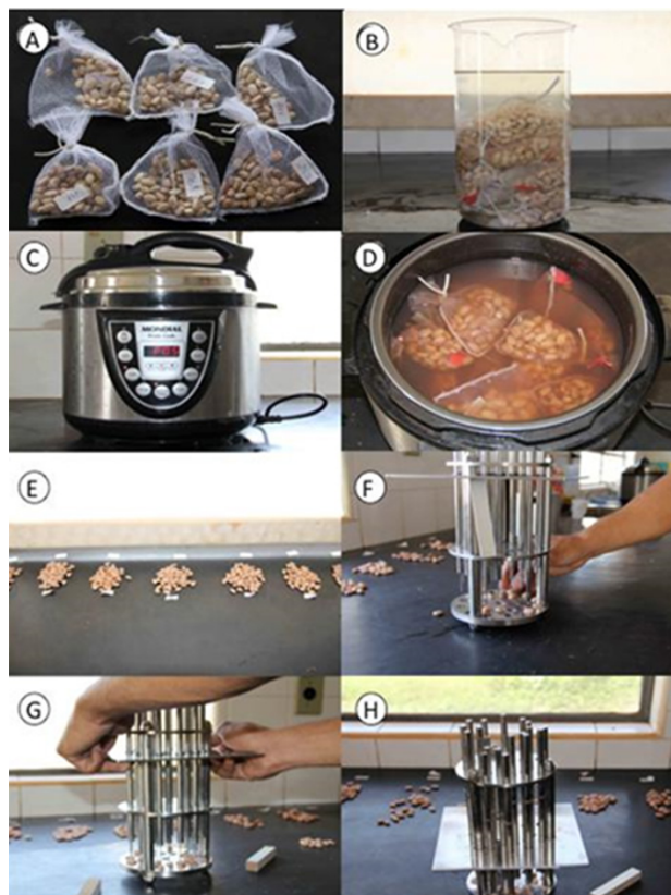
Figure 1. Steps of the procedure for evaluation of the percentage of cooked grains. A) Preparation of the samples in voile bags, B) Soaking in distilled water, C) Cooking, D) Removal of samples from the pressure cooker, E) Cooling of grains, F) Grains being arranged in the Mattson cooker, G) Lowering of pegs, H) Counting pegs that perforated the grains.

For evaluation of cooking quality, a new methodology was used. Just after evaluation of grain type, 50-grain samples of each progeny without mechanical damage were placed in voile bags with respective identification, and the bags were tied shut (Figure 1A). Two bags per progeny were prepared, that is, two replications.