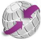
Figure 1: Theoretical Framework