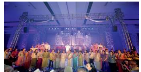
20th Regional Conference of Dermatology (Asian-Australasian) hosted by the Philippines Dermatological Society last February 2012

Sixty years of meaningful existence is perhaps a rarity, especially among people of diverse personalities and inclinations. Our society has soared in unity and camaraderie, and we fervently hope it will continue to do so.