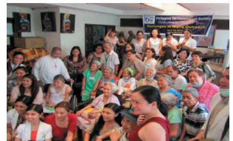
Outreach gift-giving mission at Kanlungan ni Maria, Antipolo City, last April 2012