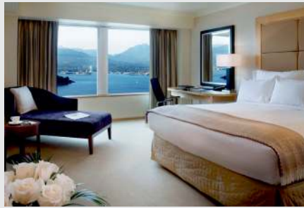
Downtown Vancouver hotels feature stunning views of the city.

Vancouver citizens live and work in the downtown core, so no matter what time of the day, the city is alive with people, energy and excitement. The Vancouver Convention Centre is within walking distance to a spectacular variety of accommodation, dining, shopping, tourist attractions and transit.