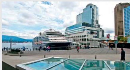
The Vancouver Convention Centre precinct includes three hotels and its own cruise ship terminal.

Although Vancouver is a pretty compact city, each area has a distinct character and accommodation options. Whether you desire historic, luxurious or boutique, your preferred accommodations are easily accessible. From four diamond properties to moderate, there are lodging choices for every style and neighborhood. Vancouver has a wide variety of accommodations that easily meet the needs of the budget-conscious or those seeking to be pampered. One of our headquarters hotels even has a cruise ship terminal built within it!