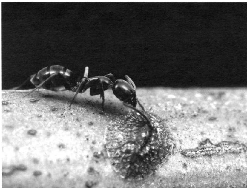
PLATE 1. Argentine ant ( Linepithema humile ) tending scale insects on citrus trees in California, USA.

tolerance to environmental conditions could also affect the extent to which invasive species can invade new environments. The consequences of these changes for the success of Argentine ants in invading new environments remain unknown; clearly, further detailed comparisons between native and introduced populations are necessary.