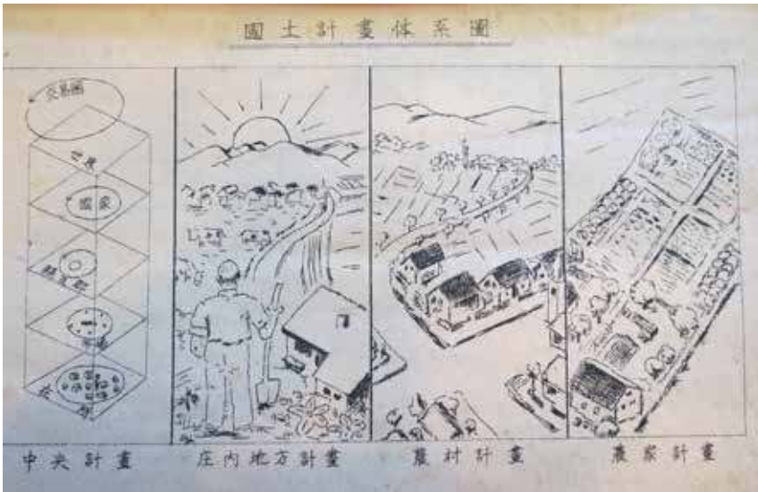
FIGURE 2. Envisioning the reform of the Shōnai region, from right to left: the ideal farmer's house, the farmer's village, the Shōnai region, within the country and the wider world. From Shōnai kokudo keikaku sōan (1943).