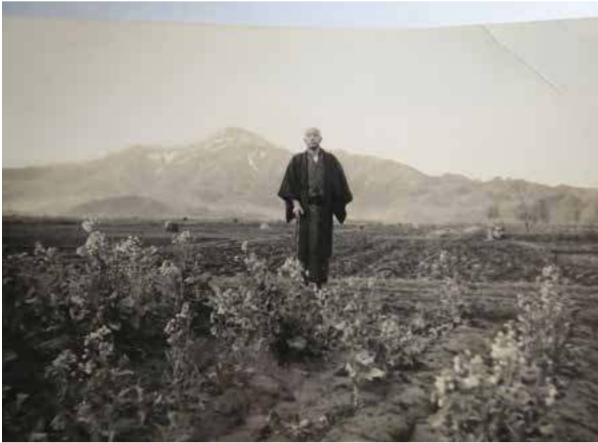
FIGURE 1. Ishiwara Kanji in the fields of the Shōnai plain in Yamagata prefecture.

Ishiwara joined the Kwantung Army's staff in Dairen in 1928, and became one of the planners of the army's takeover of Manchuria in September 1931. His name is therefore still to a large degree identified with the "Manchurian incident." In 1935, he was appointed Chief of Staff of the Operations Division of Army General Staff, and oversaw the draft of the five-year plan for 1937–1941. During the 1937 crisis over the outbreak of war in China, Ishiwara was the key figure of the "non-escalationist" faction in the army, and attempted to stop the conflict, but he was sidelined by the hardliners, who included, among others, Tōjō Hideki 東条英機. Ishiwara continued to criticize Tōjō and oppose the China war, and in response was put on the reserve, and eventually forced to leave the army. It was under the circumstances of the impasse of the war in China that the East Asia League was formed. After lecturing for a while at Ritsumeikan University, Ishiwara returned to his home province of Yamagata, from where he remained active in the East Asia League Movement.