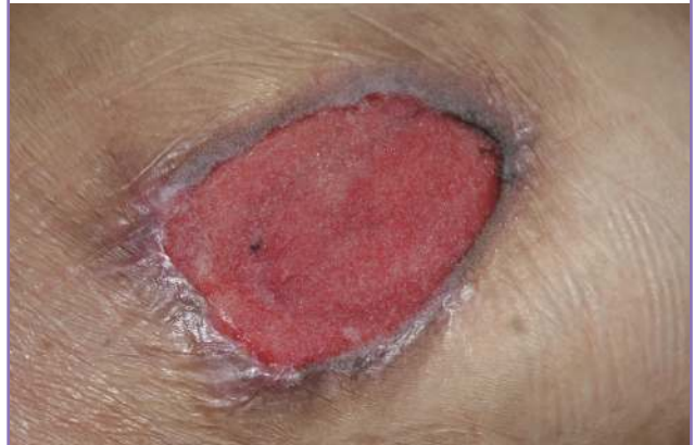
Fig. 4. Postoperative view (4 months later)

With antibiotics and negative pressure dressing therapy, infection and inflammation was controlled well and the ulcerative lesion was filled with healthy granulation.