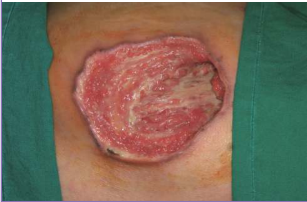
Fig. 2. After the fourth negative pressure dressing therapy

Necrotic ulceration measuring 6×9 cm was found and a pocket formation 6 cm deep was observed.