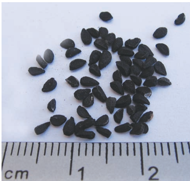
Plate 1: Nigella sativa seeds

Transverse section of seed shows single layered epidermis consisting of elliptical, thick walled cells, covered externally by a papillose cuticle and filled with dark brown contents. Epidermis is followed by 2-4 layers of thick walled tangentially elongated parenchymatous cells, followed by a reddish brown pigmented layer composed of thick walled, rectangular elongated cells. Inner to the pigment layer, is present a layer composed of thick walled rectangular elongated or nearly columnar, elongated