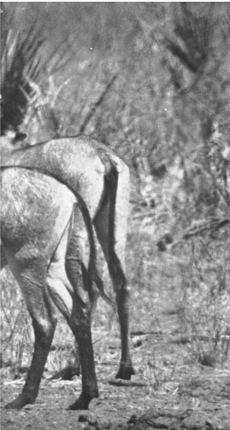
Plate 2: ROAN ANTELOPE Ray Tibbs