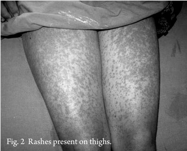
Fig. 2 Rashes present on thighs.