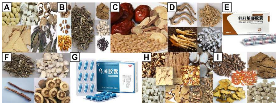
Figure 1 The nine formulas examined in this review.

suye were the core herb pairs to alleviate depression-like serotonergic and dopaminergic changes in mice. 33 Furthermore, aqueous and lipophilic extracts of BHD showed the greatest antidepressant effects, whereas the polyphenol fraction showed a moderate effect. 22 BHD reduced immobility time in the forced-swim test (FST) and tail-suspension test (TST), increased 5-HT and 5-hydroxyindoleacetic acid levels in the hippocampus and striatum, and decreased serum and liver malondialdehyde (MDA) levels in mice with a depression-like phenotype. 34 Ethanol and water extracts of BHD reduced c-Fos expression in cerebral regions of rats subjected to chronic mild stress (CMS) to a level comparable to that of fluoxetine. 35 BHD significantly