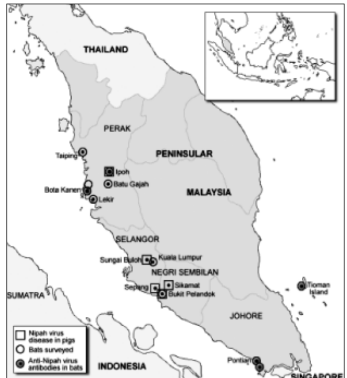
Figure 1. Primary sampling locations of bats, Malaysia.

Sembilan (n = 1), and Johore (n = 3) (Figure 1). Most primary locations had more than one sampling site. Locations included but were not restricted to places where Nipah virus-associated disease was reported in pigs. Populations of flying foxes were nonrandomly sampled by shooting foraging or roosting animals. Populations of smaller fruit bats and insectivorous bats were nonrandomly sampled by using mist nets in orchards, oil palm plantations, secondary native