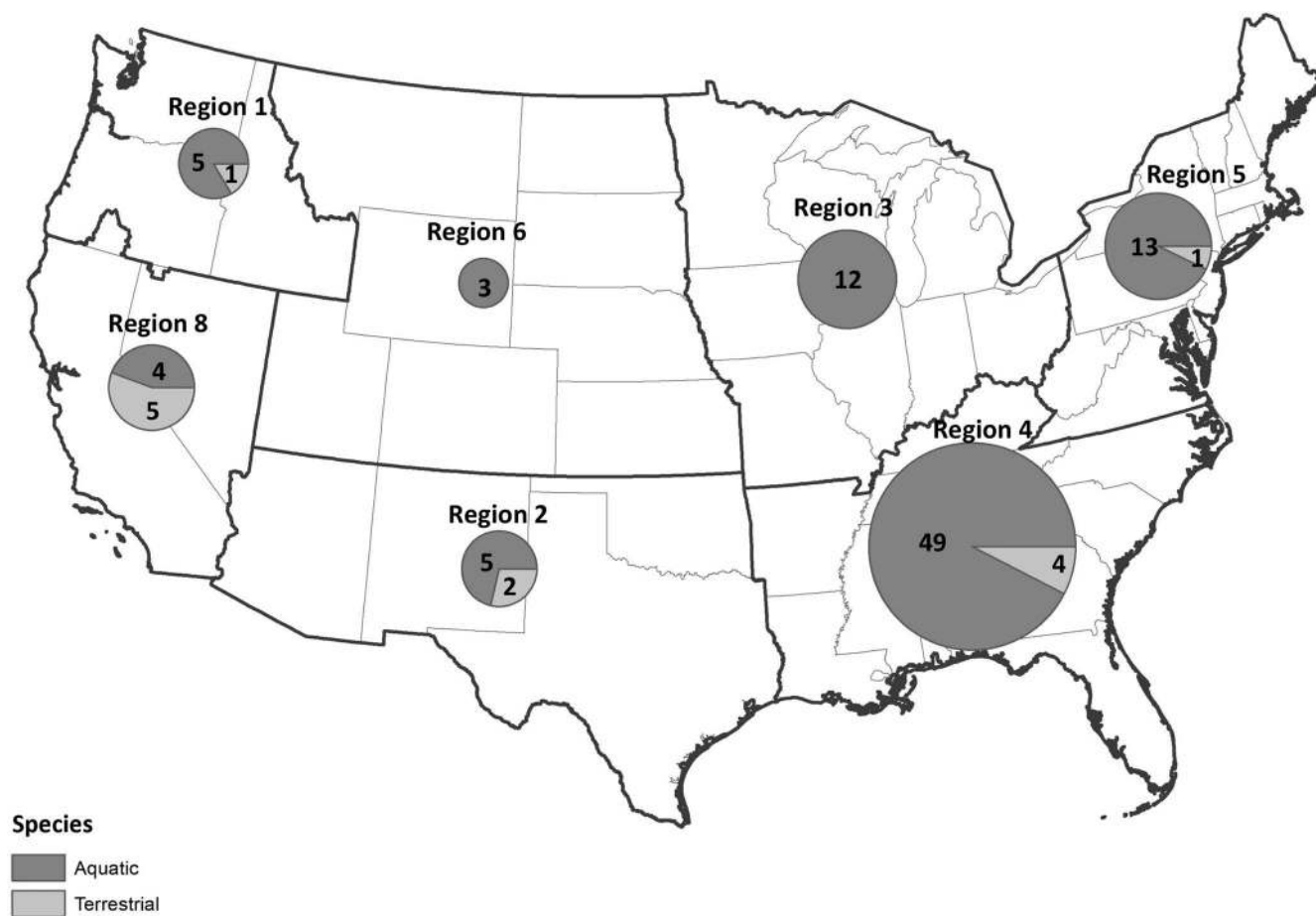
Figure 1. A Fish and Wildlife Service (FWS) Regional Map of the continental United States, with the relative magnitude and distribution of federally listed plant and wildlife species (terrestrial versus aquatic) documented as impacted by nitrogen (N, from atmospheric deposition or aquatic runoff).

N pollution increasing nonnative plant species, directly harming a species through competition. Five federally listed plant species ( Astragalus tener var. titi , Clarkia franciscana , Hackelia venusta , Helonias bullata , and Paronychia chartacea ) were directly harmed through competition with a nonnative species (table 3). For example, C. franciscana is a native species in California serpentine grasslands that, like many native serpentine plants, is outcompeted by nonnative annual grasses (box 1; Harrison and Viers 2007). Increasing levels of N pollution in many nutrient-limited ecosystems may affect native species via several mechanisms, including interspecific competition and changes in interactions with herbivores and pathogens (Gilliam 2014). These community alterations can transform species composition by creating environmental conditions more favorable for faster-growing plants, such as exotic grasses, than for native plants that are adapted to nutrient-deficient soils (Bobbink et al. 2010, Gilliam 2014). Such a shift in resource availability may be the primary mechanism controlling invasive establishment and persistence in many ecosystems (Davis and Pelsor 2001, Ochoa-Hueso et al. 2011). Researchers have investigated