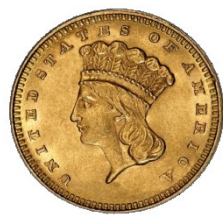
Fig. 5. Indian Princess Gold Dollar, large head—type 3 (1856–1889). The coin spot . http://www.thecoinspot.com/1dg/1856-D%20GOLD%20DOLLAR%20Type%203,%20Indian%20Princess,%20Large%20Head%20Obv.png . Accessed 23 May 2015.

A couple of decades before finding its way to the federal mints, during the 1820s, the noble Indian trope came to life. In tune with the romantic tradition and the national need for cultural independence from Europe, the era of visual celebration of American Indians began. While many painters from the East “produced Indian scenes in their studios,” some of them traveled