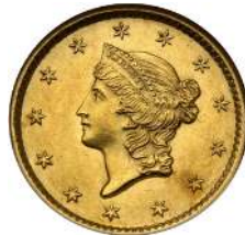
Fig. 3. Liberty Head Gold Dollar—type 1 (1849–1854). The coin spot . http://www.thecoinspot.com/1dg/1849%20ONE%20DOLLAR%20-%20GOLD%20Type%201,%20Liberty%20Head%20Obv.png . Accessed 23 May 2015.

feather bonnet (type 2 and 3 gold dollars), female figures on both the cent and the dollar mints were typically Caucasian, and their indigenous décor was distinctly unrelated to any Native tribe of the time.