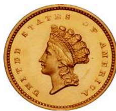
Fig. 4. Indian Princess Gold Dollar, small head—type 2 (1854–1856).