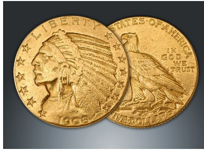
Fig. 7. Half Eagle Indian Head Gold Coin (1908–1929). Northwest territorial mint— numismatic coins . https://bullion.nwtmint.com/rare_halfindians.php . Accessed 23 May 2015.