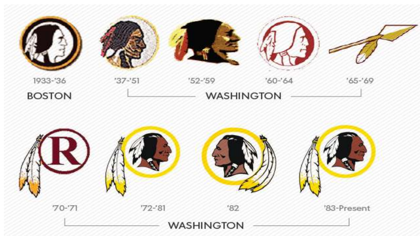
Fig. 9. Evolution of the Washington Redsk*ns logo (1933–the Present). USA Today—sports . http://i.usatoday.net/_common/_notches/8863c3fe-494a-4024-b2c9-b8793fccb630-Logos_2.png . Accessed 23 May 2015.