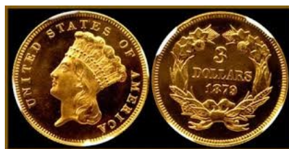
Fig. 2. Three-dollar gold coin (1854–1889). U.S. rare coin investments . http://www.usrarecoininvestments.com/coin_info/three_dollars.htm . Accessed 23 May 2015.