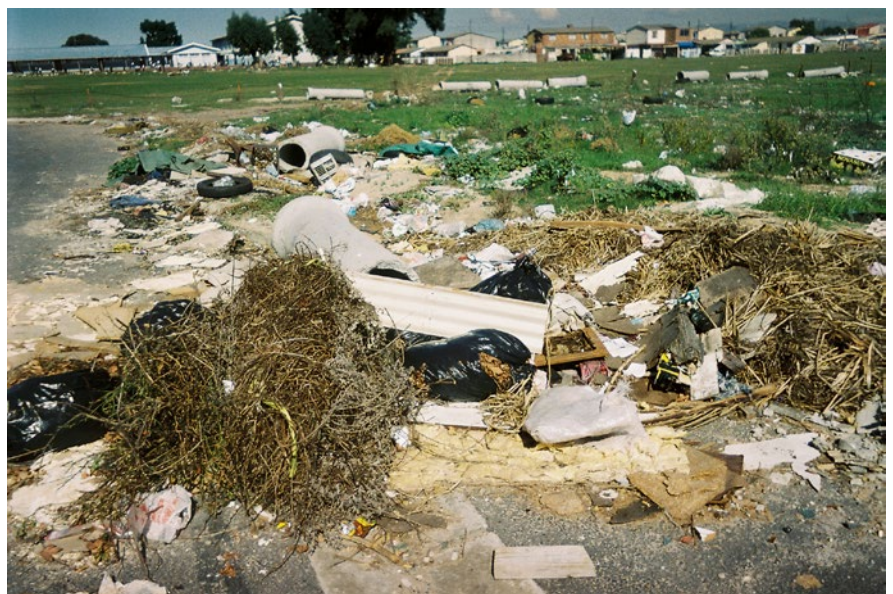
Figure 2: Illegal dumpsites near Arcadia Primary

During the 1990s, the area was plagued by numerous sources of pollution. Land pollution was characterised by extreme littering in all the streets and parks. Illegal dumping compounded the issue,