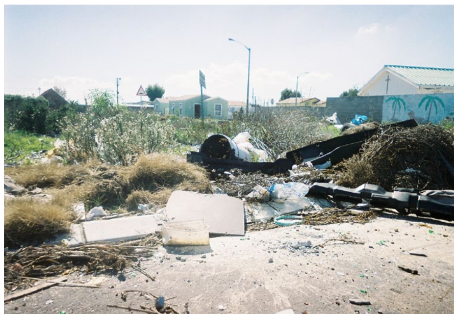
Figure 3: Illegal dumpsites near Bonteheuwel houses and a church