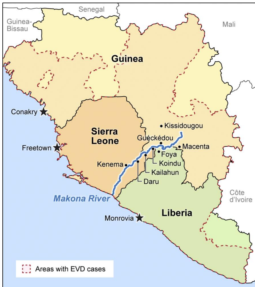
Figure 1. Location of the Makona River.

At the time of writing, 102 coding-complete genomic sequences of EBOV/Mak have been deposited into GenBank, all of which were obtained directly from clinical samples (“p0”) [1,6]. Following the rules laid out in filovirus standardized nomenclature [10], the names for these sequences therefore should contain the <suffix> “-wt”. In addition, one fragment of the L gene of one isolate of EBOV/Mak was deposited. Based on definitions described in standardized nomenclature [10], the corresponding <suffix> field should therefore be filled with “-frag”. All currently deposited sequences stem from either Guinean, Sierra Leonean, or Nigerian samples. The 3-letter country codes to be used the <country> field [10] for all countries that have thus far handled patients infected with EBOV/Mak are summarized in Table 2.