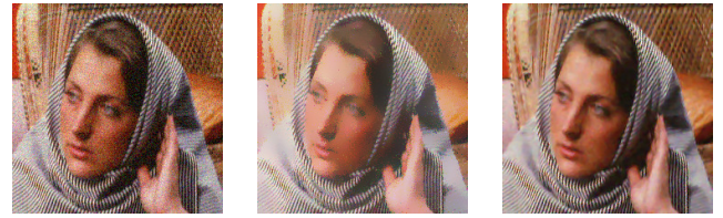
(a) Color image + noise. (b) Bilateral filtering[19]. (c) Anisotropic PDE[20].