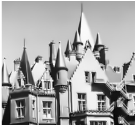
(b) Denoised version using our non-local anisotropic diffusion Eq.(4).