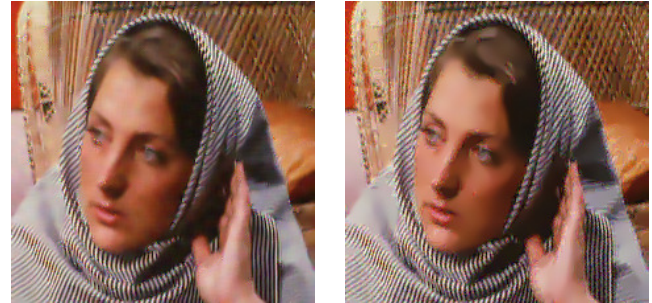
(d) Non-Local Means [5]. (e) Patch-based anisotropic diffusion (Our proposed method Eq.(4)).