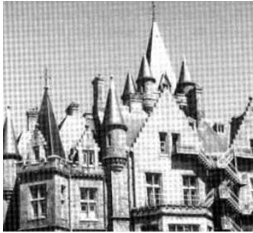
(a) Original grayscale image with texture noise.