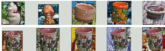
Figure 1: COIL-100 database with encrusted backgrounds, first row: negative examples, second row: positive examples.

Although matching based kernel leads to a good performance, the Mercer condition is not usually insured. Fig. 2 presents ranked eigenvalues of the Gram matrix for different values of \sigma . For \sigma = 100 , there exists negative eigenvalues of the Gram matrix, this means that matching kernel is not positive definite in general. By decreasing the scale \sigma , eigenvalues become always positive. Fig. 3-a shows the variation of the recognition error with respect to \log_{10}(\sigma) . The optimal value obtained by cross-validation is \sigma^* = 10^{-3} which corresponds to a positive definite Gram matrix (positive eigenvalues). Fig. 3-b represents the bound of probability p_d (5) in a logarithmic scale with respect to \log_{10}(\sigma) . The probability confidence is set as \eta = 1 - 10^{-6} . For the optimal choice of \sigma , the bound is very poor and useless. For \sigma = 10^{-4} , which corresponds to a recognition error of 8%, we have p_d \leq 10^{-3} . We can say for these values that Gram matrix is diagonally dominant almost sure and so it is positive definite one. By choosing \sigma = 10^{-4} we loose almost 5 % of recognition error which is not too much compared to the obtained warranty of convergence of the SVM algorithm to unique solution.