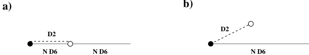
Figure 2: D-brane realization of the N_f = N_c SQCD theory in a geometry of the kind in Appendix A. The construction shows that instanton on its BPS locus (a) and away from it (b). Notice that gauge D-branes recombine and remain BPS through the process.

D2-brane wrapped on A . The setup is easy to engineer using the geometries described in Appendix A, by wrapping sets of N D6-branes on a compact and a non-compact 3-cycles as shown in Figure 2. 8 As in previous examples, there is a real parameter, given by the size of the 3-cycle B dual to A , which controls the misalignment of the instanton, see Figure 2b. Note that the misalignment of the instanton does not imply a misalignment of the gauge D-branes, since the latter can recombine and remain BPS throughout moduli space. This recombination is important, as we will recall in Section 4.3.