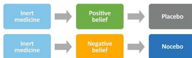
Fig. 1 Placebo versus nocebo [2, 3]

The NOR-SWITCH study, a 52-week, randomised, double-blind, non-inferiority, phase IV study, was conducted in adult patients with axial spondyloarthritis, rheumatoid arthritis (RA), psoriatic arthritis (PsA), Crohn’s disease, ulcerative colitis, or psoriasis. Patients with informed consent were randomised to either continue originator infliximab (IFX) or to transition to biosimilar infliximab (CT-P13) [21]. This trial demonstrated that switching from IFX to CT-P13 was non-inferior to continued treatment with IFX [21]. However, discordance in patient and physician outcome reporting was observed, which is a phenomenon previously reported [22]. Using patient-reported outcome (PRO) measures such as patient global assessment—one of the most widely reported PROs in RA—allows a more holistic assessment of disease and provides the patients’ perspective on aspects of their condition [23]. Figure 2 highlights disease experience also