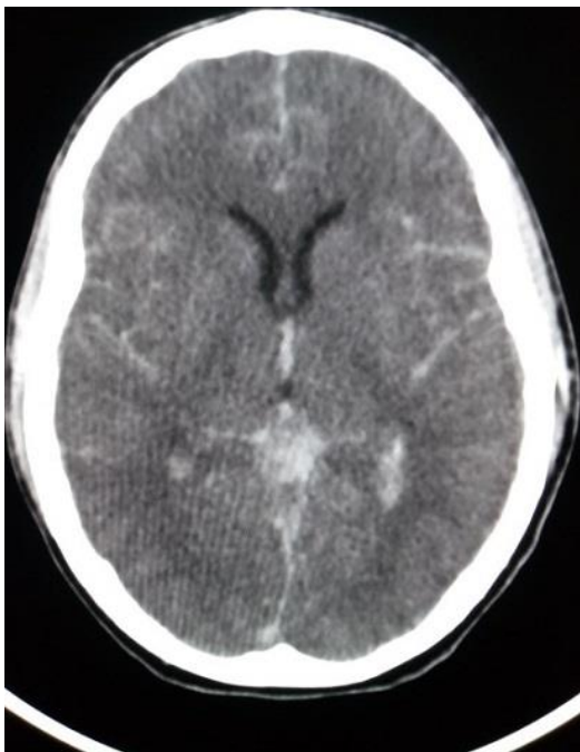
Figure 2: Unenhanced CT axial image shows subarachnoid blood with intra-ventricular extension and peripheral hemorrhage outlining the cerebral sulci