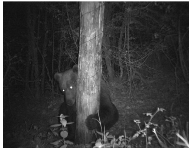
Fig. 2 A brown bear in Greece captured by an infrared camera trap while marking and rubbing on a power pole

directly after hibernation, a time with increased energetic requirements, reduced food availability, and loss of body mass at these latitudes (Swenson et al. 2007).