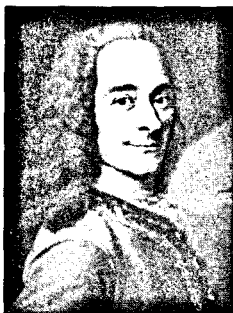
Fig. 1.2 “Doubt is not a pleasant condition, but certainty is absurd” – Francois Marie Voltaire (1694–1778).

We hope that many students of statistics will find this book useful, but it was written primarily with the scientist and engineer in mind. With nothing against statisticians (some of our best friends know statisticians) our approach emphasizes the application of the method over its mathematical theory. We have intentionally made the text less heavy with theory and instead emphasized applications and examples. If you come into this course thinking the history of nonparametric statistics is dry and unexciting, you are probably right, at least compared to the history of ancient Rome, the British monarchy or maybe even Wayne Newton 1 . Nonetheless, we made efforts to convince you otherwise by noting the interesting historical context of the research and the personalities behind its development. For example, we will learn more about Karl Pearson (1857–1936) and R. A. Fisher (1890–1962), legendary scientists and competitive arch-rivals, who both contributed greatly to the foundation of nonparametric statistics through their separate research directions.