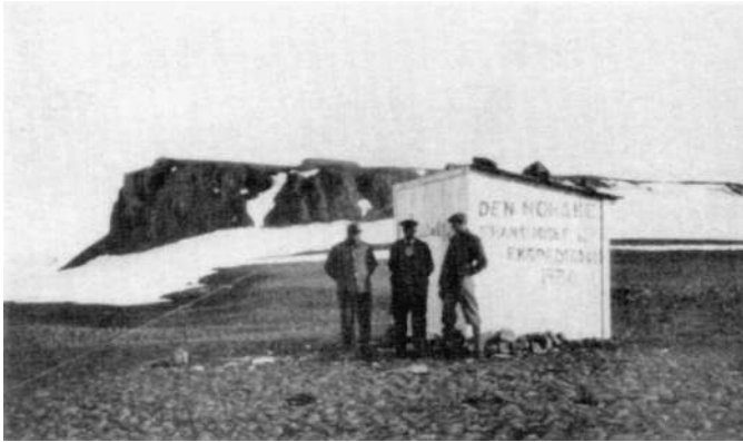
FIG. 4. Cabin erected at Cape Forbes, George Land in Franz Josef Land in August 1930.

So why did the annexation take place, in spite of the prime minister's change of heart? We can only make a qualified guess. We believe it is reasonable to assume that the annexation of Victoria Island was carried out by a group of enthusiasts situated in influential positions within the bureaucracy, despite the withdrawal of official governmental support. The following information may support this view.