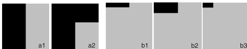
Figure 2 Predictive scenarios yielding a kappa score of 0.6. a1 and b1 represent the real distribution of two species (a and b), and a2, b2, and b3 the predicted distributions. The presence of the species is represented in black, and its absence in grey. In the first example, species a occupies half of the considered territory, and a kappa value of 0.6 can be obtained when the model overpredicts the presence of the species by 40%. Note that, in this case, the inverse is also true, i.e. if black was absence and grey presence, the model would underpredict the presence of the species by 40%. In the second example, species b occupies 5% of the considered territory, and a kappa value of 0.6 is obtained when the model overpredicts the presence of the species by 102% (b2; i.e. the predicted geographical range is duplicated with respect to the real range), or when the model underpredicts the presence of the species by a 44% (b3).

Regardless of any conceptual misunderstanding, species distribution models could provide good predictions if they fit the evaluation data tightly. Sometimes it could be possible to forecast a given part of the realized distribution of a species using methods that are more adequate to describe its potential distribution. In this case, it is necessary to be particularly demanding in the evaluation of the agreement between observations and predictions. However, the discrimination between 'good' and 'bad' models is based in subjective ranges of indices that measure only if the agreement between predicted and observed distribution is significantly higher than the expected by chance. For example, in the case of the kappa statistic, values equal or smaller than 0.6 are commonly thought to indicate reliable predictions (i.e. a good agreement between observed and predicted distributions; see, e.g. Elith et al. , 2006; Araújo & Luoto, 2007; or Tsoar et al. , 2007). However, a kappa value of 0.6 can be obtained with degrees of under- or overprediction of 40%, for a species that occupies half of the territory (Fig. 2a). In the case of a rare species occupying