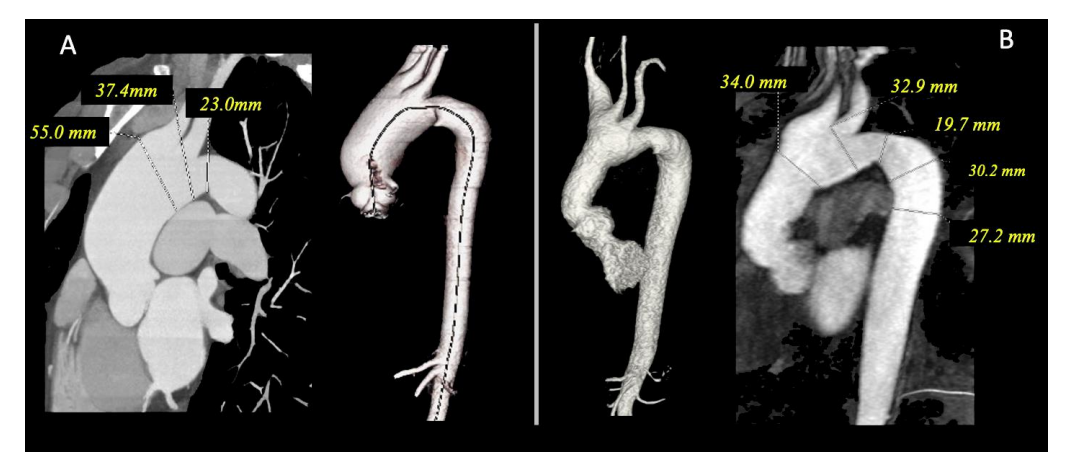
Figure 2. Case 2: ( A ) Chest CT angiography showing aneurysm of the ascending aorta (55 mm) with tricuspid aortic valve, bovine aortic arch and dilatation of right brachiocephalic trunk. ( B ) Postoperative angio-MRI with normal size of ascending aorta.

In addition, this patient is also a carrier of a MIB1 (NM_020774.4) variant: c.971_972del p.Gln324ArgfsTer13 located in exon 7. This is a null variant (frameshift) so it should supposedly give rise to a truncated protein. This variant has not been previously described and is not found in the general population databases (according to the GnomAD database). Following the criteria for the classification of variants recommended by the ACMG, it is classified as a likely pathogenic (PVS1, PM2) [16].