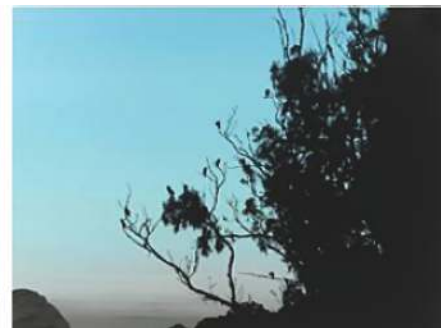
Figure 3. Glenn Rubsamen, I've decided to say nothing (2006). Acryllic on linen, dyptich.

kind of postmodern in-between (a neither-nor). Indeed, both metamodernism and the postmodern turn to pluralism, irony, and deconstruction in order to counter a modernist fanaticism. However, in metamodernism this pluralism and irony are utilized to counter the modern aspiration, while in postmodernism they are employed to cancel it out. That is to say, metamodern irony is intrinsically bound to desire, whereas postmodern irony is inherently tied to apathy. Consequently, the metamodern art work (or rather, at least as the metamodern art work has so far expressed itself by means of neoromanticism) redirects the modern piece by drawing attention to what it cannot present in its language, what it cannot signify in its own terms (that what is often called the sublime, the uncanny, the ethereal, the mysterious, and so forth). The postmodern work deconstructs it by pointing exactly to what it presents, by exposing precisely what it signifies.