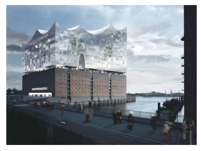
Figure 5. Herzog & de Meuron, Elbe Philharmonie. Copyright Herzog & de Meuron.

bind of both/neither—expose a tension that cannot be described in terms of the modern or the postmodern, but must be conceived of as metamodernism expressed by means of a neoromanticism.<sup>39</sup> If these artists look back at the Romantic it is neither because they simply want to laugh at it (parody) nor because they wish to cry for it (nostalgia). They look back instead in order to perceive anew a future that was lost from sight. Metamodern neoromanticism should not merely be understood as re-appropriation; it should be interpreted as re-signification: it is the re-signification of "the commonplace with significance, the ordinary with mystery, the familiar with the seemliness of the unfamiliar, and the finite with the semblance of the infinite". Indeed, it should be interpreted as Novalis, as the opening up of new lands in situ of the old one.