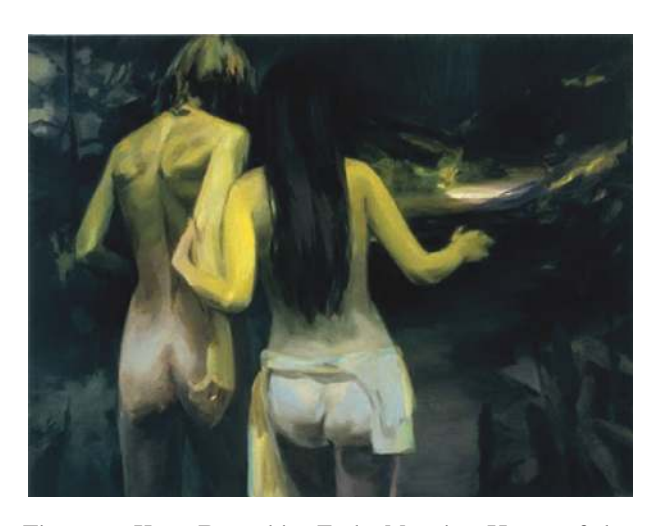
Figure 2. Kaye Donachie, Early Morning Hours of the Night (2003). Oil on Canvas.

One should be careful, however, not to confuse this oscillating tension (a both–neither) with some