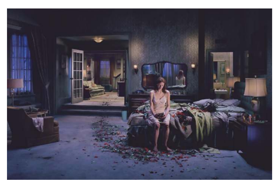
Figure 4. Gregory Crewdson, Untitled (2004). Photograph.

because architecture cannot but be concrete. The works of "starchitects" Herzog and De Meuron are exemplary here. Their more recent designs express a metamodern attitude in and through a style that can only be called neoromantic. A few brief descriptions suffice, here, to get a hint of their look and feel. The exterior of the De Young Museum (San Francisco, 2005) is clad in copper plates that will slowly turn green as a result of oxidization; the interior of the Walker Art Center (Minneapolis, 2005) holds such natural elements as chandeliers of rock and crystal; and the façade of the Caixa Forum (Madrid, 2008) appears to be partly rusting and partly overtaken by vegetation. While the above examples are appropriations or expansions of existing sites, their recent designs for whole new structures are even more telling. The library of the Brandenburg Technical University (Cottbus, 2004) is a gothic castle with a translucent façade overlain with white lettering; the Chinese national stadium (Beijing, 2008) looks like a "dark and enchanted forest" from up close and like a giant bird's nest from a far<sup>38</sup>; the residential skyscraper at 560 Leonard street (NYC, under construction) is reminiscent of an eroded rock; the Miami Art Museum (Florida, under construction) contains Babylonic hanging gardens; the Elbe Philharmonic Hall (Hamburg, under construction, see Figure 5) seems to be a