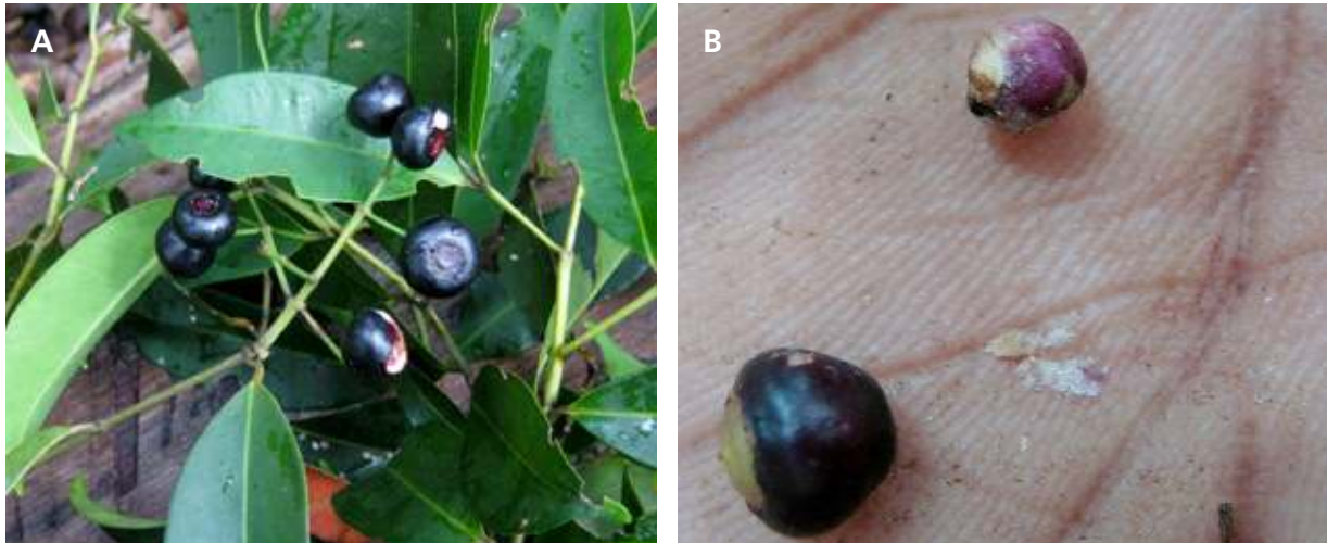
Fig. 5 Syzygium lababiense B.J.Conn & K.Q.Damas. A. fruiting branchlet showing leaves and purple fleshy fruits, showing leaves with indistinct (faint) secondary veins; B. close-up of fruit (left) and seed.