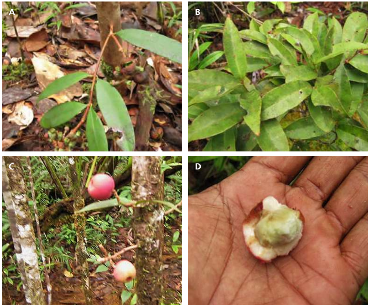
Fig. 6. Syzygium kuiense B.J.Conn & K.Q.Damas. A. leaves near base of young sapling; B. details of leaves, showing the indistinct (faint) secondary veins; C. cauliflorous fruits; D. seed exposed after some of fruit wall removed.