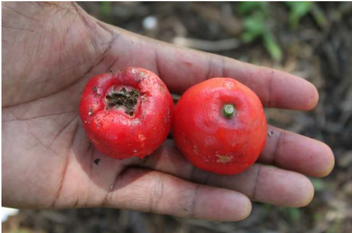
Fig. 3. Syzygium platycarpum (Diels) Merr. & L.M.Perry. Fruits, showing apical view with remains of calyx (left) and basal view with distal remains of pedicel (right).

Syzygium lababiense B.J.Conn & K.Q.Damas sp. nov.