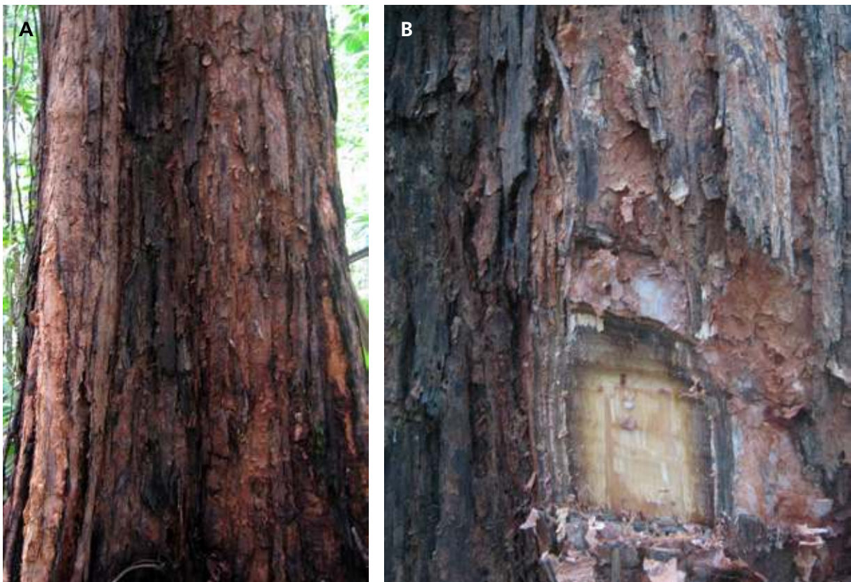
Fig. 4. Syzygium lababiense B.J.Conn & K.Q.Damas. A. basal section of trunk showing rough flaky, red-brown outer bark; B. outer bark with blaze showing single layered inner fibrous bark.

Notes: Syzygium lababiense is a minor hardwood species that is only known from the Kamiali area of the Morobe Province.