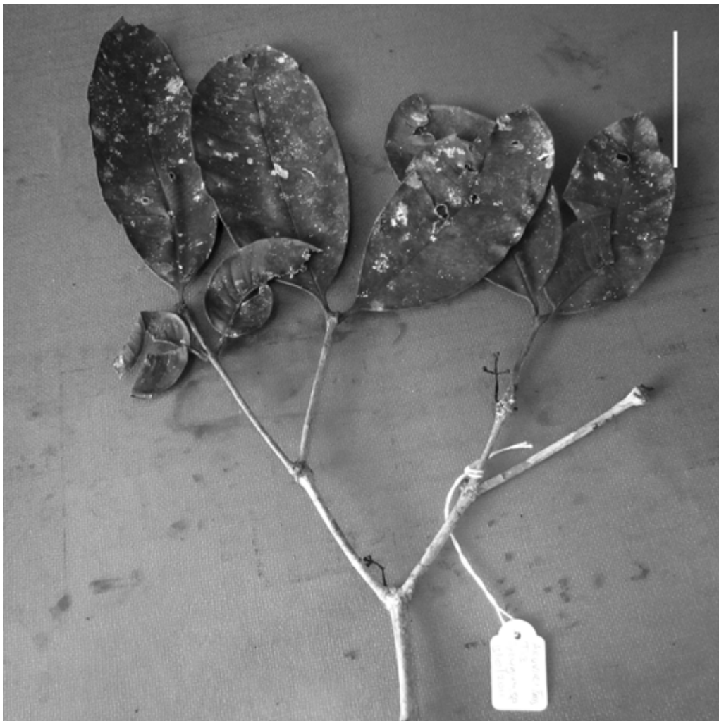
Fig. 1. Syzygium pterotum . Herbarium collection (Damas LAE79730) showing a branchlets with leaves and two old inflorescences with the remains of the flowers. Scale bar: 5 cm

Canopy trees, up to 20 m high; bole cylindrical, up to 30 cm diam., straight, up to 10 m long; buttresses absent, or if present, then short. Bark grey or brown, rough, scaly or flaky or peeling; lenticels irregular; bark <25 mm thick; under-bark pink or grey; blaze strongly aromatic, pleasant; consisting of one layer, white or yellow, fibrous; exudate colourless, not readily flowing, changing to purple or grey on exposure to air, not sticky. Branchlets 4-angled, soon becoming slightly flattened to more or less terete. Leaves spaced along branches; petiole 8–10 mm long, not winged, not swollen; lamina elliptic to narrowly elliptic, 13–18 cm long, 5.5–7.5 cm wide; base cuneate, margin flat, apex acuminate, venation pinnate, secondary veins open, 12–15 on each side of mid vein, prominent, angle of divergence from mid vein 28–30(–35)°; tertiary veins indistinct; intramarginal vein 1, distinct, 1–1.5 mm from lamina margin; lower surface blue-green, upper surface dark green, hairs absent, oil glands not visible (to unaided eye). Inflorescence axillary, branched (3-flowered); peduncles c. 5 mm long, shortly winged (wings c. 0.2 mm wide), hence appearing quadrangular in cross-section; pedicel c. 1 mm long; bracteoles not seen; only old flowers seen (shape and size not measurable); base of staminal filaments persistent, many. Fruits sub-ellipsoidal, 20–30 mm long, 15–20 mm diam., fleshy. Seeds 1, up to 30 mm, up to 15 mm wide. Fig. 1