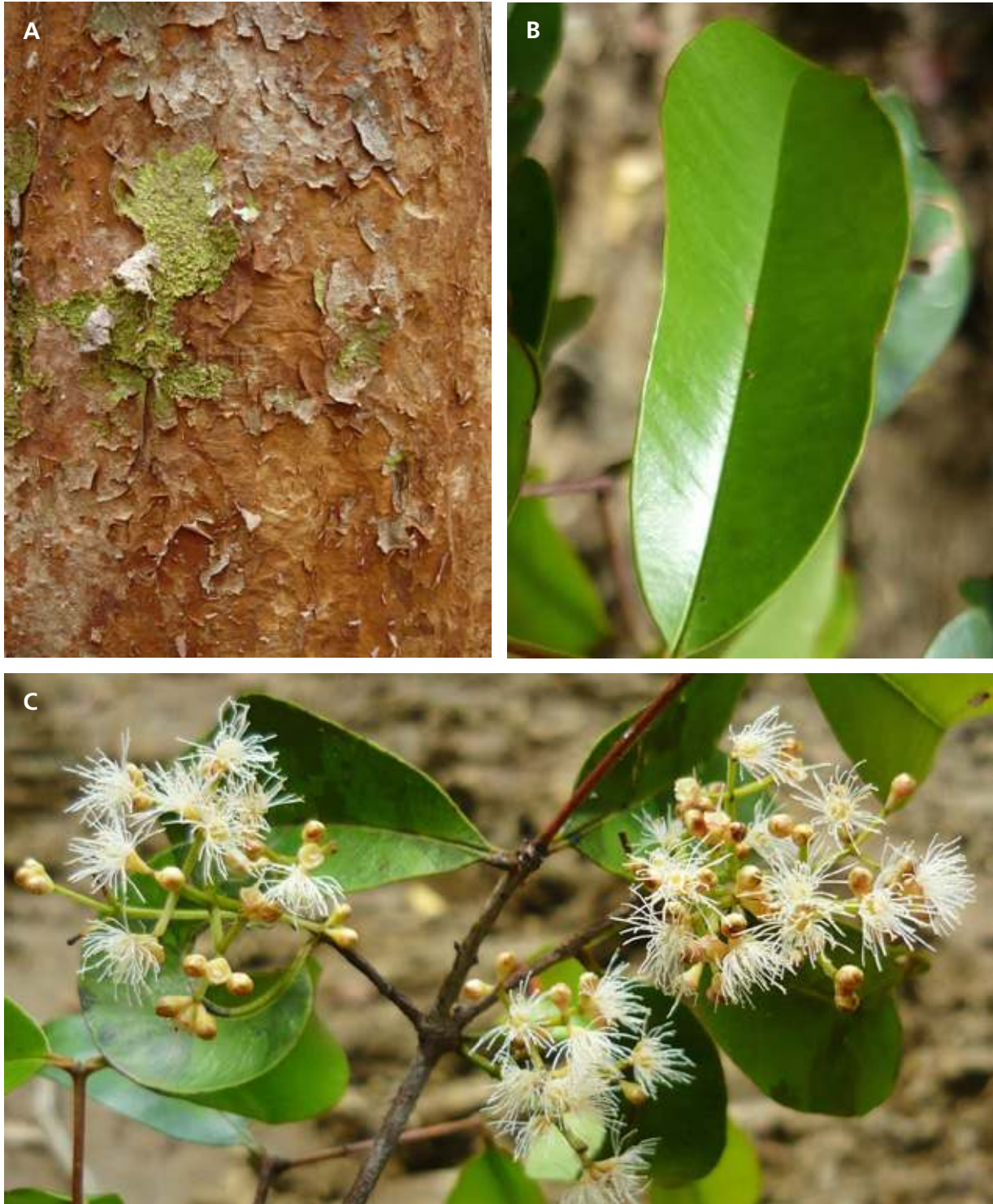
Fig. 7. Syzygium cravenii B.J.Conn & K.Q.Damas. A. basal section of trunk showing rough papery, peeling outer bark; B. details of leaves, showing the indistinct (faint) secondary veins; C. flowering branchlets showing axillary inflorescence and flowers.

Notes: This minor hardwood species is only known from the type collection.