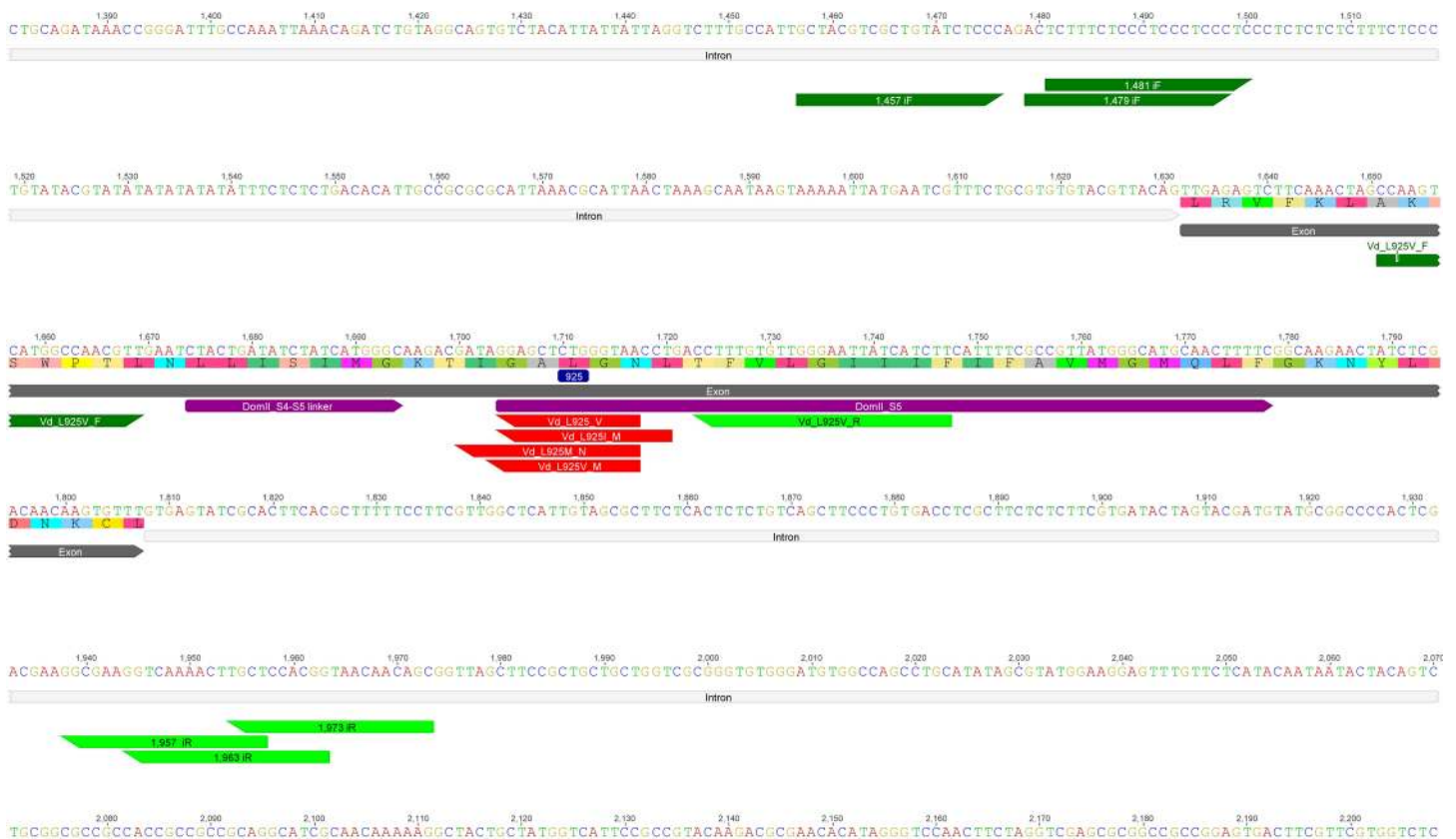
Fig 1. Intron-exon-intron section of the V. destructor VGSC Domain II. Section including the linker between transmembrane segments 4 and 5 (DomII_S4-S5) and the transmembrane segment 5 (IIS5) [in magenta]. Intron [light grey] and exon regions [dark grey], as well as the annealing positions for primers [green] and TaqMan® probes [red] are shown. Numbering corresponds to that in Accession KC152655. The position of the residue 925 of the channel protein is highlighted in blue.

Genomic DNA from at least 2 individuals per sample was used as a template to PCR-amplify fragments covering the relevant region of domain II (Fig 1) following a two-step nested PCR strategy [27]. For the primary amplification (PCR1), the primers were 1457iF (5'-GCTACGT CGCTGTATCTCCC-3') and 1973iR (5'-GCTGTTGTTACCGTGGAGCA-3') and for the secondary amplification (PCR2), the primers were 1479iF (5'-ACTCTTCTCCCTCCCTCCC-3') and 1963iR (5'-CCGTGGAGCAAGTTTTGACC-3'). For each amplification, the reaction mixture contained 0.4 μM of each primer, 15 μl of DreamTaq Green PCR Master Mix (2×) (Thermo Scientific), 12 μl of distilled water and 1 μl of genomic DNA (or PCR 1) to a final volume of 30 μl. Cycling conditions were: 94°C for 1 min followed by 35 cycles of 94°C for 20 s, 61°C for 20 s and 72°C for 45 s, and final extension at 72°C for 5 min. The PCR fragments were precipitated with ethanol and direct sequenced (Eurofins MWG Operon, Germany) using the primers 1481iF (5'-TCTTCTCCCTCCCTCCCTC-3') and 1957iR (5'-AGCAAGTTTTGA CCTTCGCC-3'). All primers were designed and the sequences analysed using Geneious software (Version 8.1, http://www.geneious.com/ ).