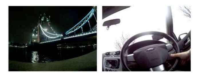
Figure 1: Sample Wearable Camera images from the Test Collection

Two steps were taken to ensure privacy of both the lifeloggers and individuals (subjects and bystanders) captured in the lifelog, by removing identifiable content. Firstly, each recognisable face in every image was blurred in a manual process, which ensured no false positives or missed faces. A second step was to resize every image down to 1024 \times 768 resolution which had the effect of both reducing the disksize of the collection, but also rendering the majority of any on-screen text captured by the lifelogging camera to be illegible. Since privacy extends beyond content of images, the Moves app automatically converts all locations from absolute GPS locations into semantic locations, which resulted in potentially sensitive absolute addresses being labeled with generic names such as 'home' or 'work', thereby making it more unlikely that the lifeloggers could be identified.