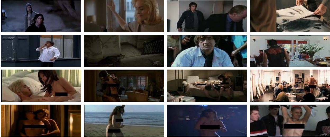
Figure 1: Examples of non-nude (first and second rows) and nude frames (third and fourth rows) from the database built for this work.

is built; Section IV shows how we propose to use BoVF representations for the task of nudity detection in videos; in Section V, numerical and visual results of a set of experiments are presented and discussed; finally, Section VI presents some concluding remarks for the paper.