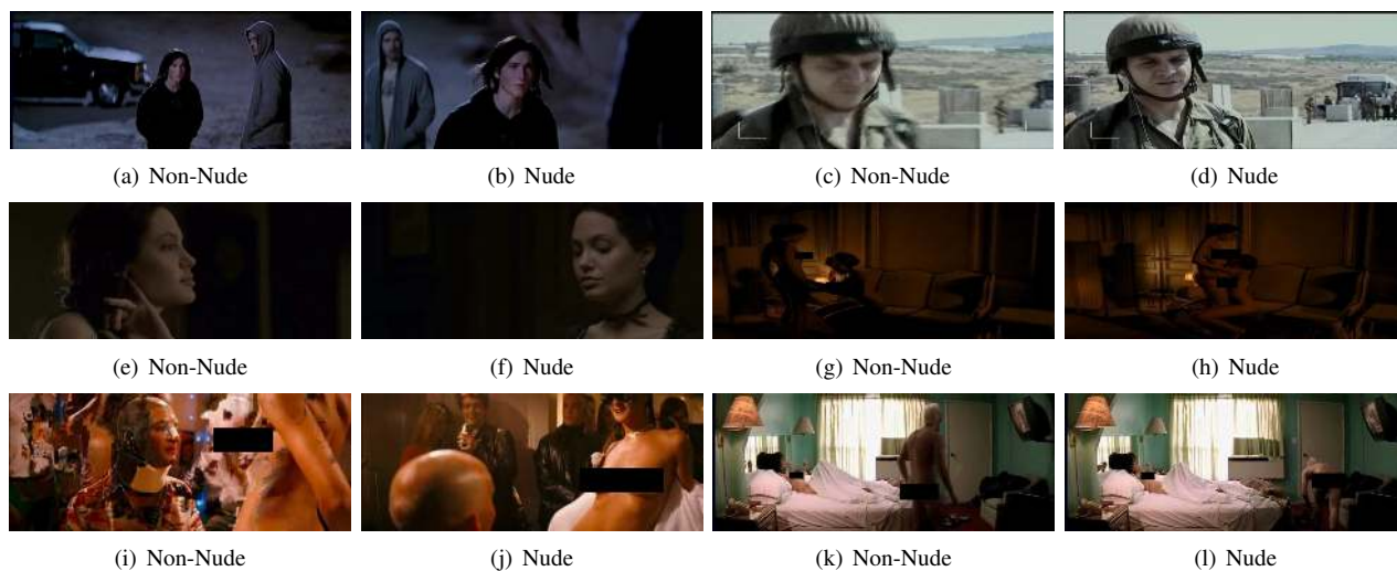
Figure 3: Images of video segments in which the voting process has resulted in a tie, and therefore a final classification as nude. The classes provided by the frame classifier are indicated. For segments represented by frames (a) to (f), this yielded false-positive results, and for those ones represented by frames (g) to (l), the ambiguity was correctly solved to provide true-positives.