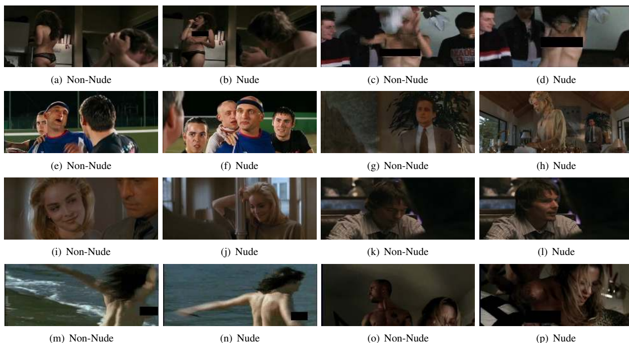
Figure 4: Some more cases in which some ambiguity was found, but not to the point of a tie: in cases (a) to (d) and (i) to (l), the final classification was non-nude, and in cases (e) to (h) and (m) to (p), the final classification was nude. This means that in the first two lines, the voting was not able to solve the ambiguity, while the third and fourth lines show examples in which the voting was fundamental.