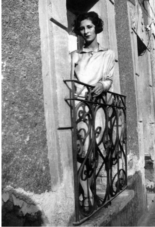
Luisa Moreno, a Guatemalan immigrant, shown here in a 1927 photograph, rose in the ranks of the Congress of Industrial Organizations (CIO) and helped organize the first national Latino civil rights assembly in 1939.

materialized; only a few fragile southern California chapters limped along during the war years. 41